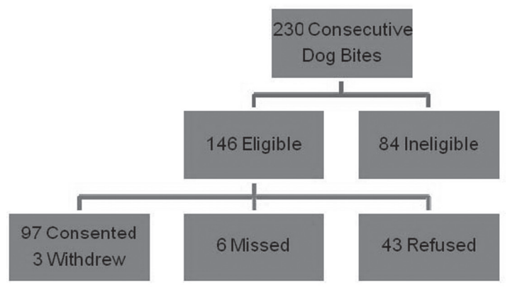
Figure 2. CONSORT diagram for the randomized control trial on the use of prophylactic antibiotics for dog bites

In order to consider all eligible wounds and maximize patient recruitment, patients with dog bites were identified through a real time notification and tracking system of all ED patients, previously described. The notification system screened all chief complaints on a tracking system 24/7, and the research coordinator was paged when a patient registered with "dog" or "bite" in the complaint. The coordinator then called to verify it was a dog bite and request patient enrollment. The emergency medicine physician obtained informed consent from the patient and enrolled the patient into a secure web-based system. The requested demographic, insurance, and visit data for this study was automatically sent