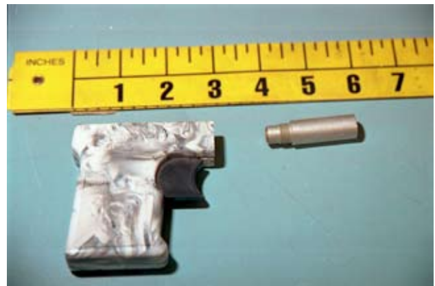
Figure 1. CS emitting personal-protection weapon with barrel detached.

caretaker rushed the children out of the house and immediately called 911. A call identifying "four people burned by fireworks" was entered into the 911 system. This information was relayed to the private, contracted ambulance-service communications center, and a paramedic unit (EMT-P/EMT) was dispatched with only that information. The description of the event, the patients' signs and symptoms, and military experience with CS gas led the responding paramedic to believe that the patients had been exposed to CS. He decided that field decontamination of the patients was therefore unnecessary. Without making radio contact, paramedics transported the patients to the Emergency Department (ED) of Kern Medical Center, a 150-bed county teaching hospital and Level II trauma center. The first hospital notification regarding the patients was made when the paramedic field supervisor walked into the physicians' charting area of the ED and stated there was a paramedic unit outside the ED with seven patients who had been exposed to "CNS Gas."