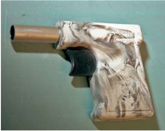
Figure 2. CS emitting personal-protection weapon assembled.