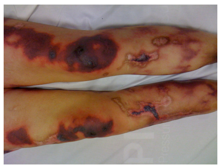
Figure 2. Retiform purpuric skin lesions with eschar on lower extremities.