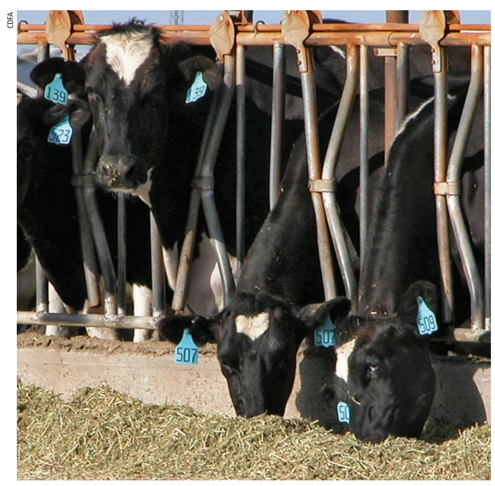
By calculating nutrient balances for the whole dairy operation, operators can improve feed efficiency and protect water quality. More-efficient cropping practices on dairies that grow their own silage and hay, as well as manure management, are important strategies.

In addition to the whole-farm nutrient balance previously discussed, two additional balances can be estimated: (1) when diets are adjusted according to animal requirements and (2) when manure is applied to the soil according to crop requirements (fig. 1). In both cases, nitrogen is one of the most studied nutrients used to estimate whole-farm nutrient balances.