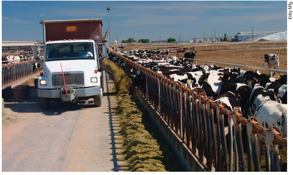
Dairy operations in California are becoming more concentrated, with more cows, more milk produced per cow, and more feed purchased off-farm. In order to limit pollution from nutrient-laden runoff, California dairies in the Central Valley face new water-quality-related rules.

The WMP and NMP will be important objectives for California dairy producers in the coming years. According to the WMP requirements for each dairy, producers must be prepared with sufficient storage capacity to contain all the manure that their dairy produces, to avoid illegal discharges on or off site. They must also be prepared to apply manure according to an NMP based on the chemical composition of their manure and soil, as well as crop requirements.