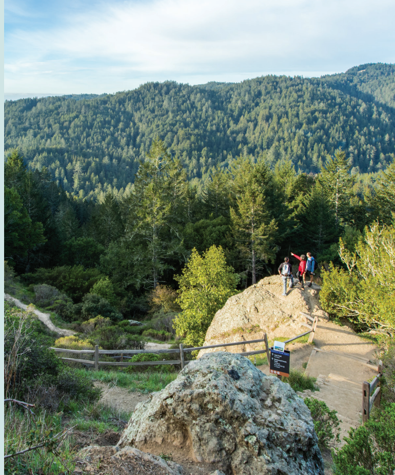
The key elements of collaborative leadership described here provide a pathway to help us achieve our shared visions.

Within each of these networks are place-based stories that highlight how collaboration can engender meaningful relationships while generating tangible outcomes. In the Santa Cruz Mountains along California's Central Coast, a partnership between California State Parks, land trusts, resource conservation districts, and the Amah Mutsun Tribe