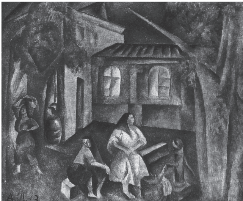
FIGURE 1.4 Russian neoprimitivism and "the Beautiful East," Aleksandr Shevchenko, Laudresses (1913).

it provides on the Soviet avant-garde's relation to minority and non-Western cultures. That is, we must follow Khlebnikov down the rabbit hole of Russian modernists and avant-gardists identifying in particular with Asia. This will take us to the prerevolutionary years, then to the alignment of this tradition with the Bolshevik Revolution, followed by its resonance with pilgrims like Claude McKay. My starting point for this brief excursion is an influential group of painters from the second decade of the twentieth century who called themselves the neoprimitivists and who counted Khlebnikov and Tatlin among their many allies. At first glance, this group's works and writings seem to mimic Western chinoiserie in claiming "the beautiful East" as the key to disrupting perception and continuity: "We are striving to seek new paths for our art, but we do not reject the old completely, and of its previous forms we rec-