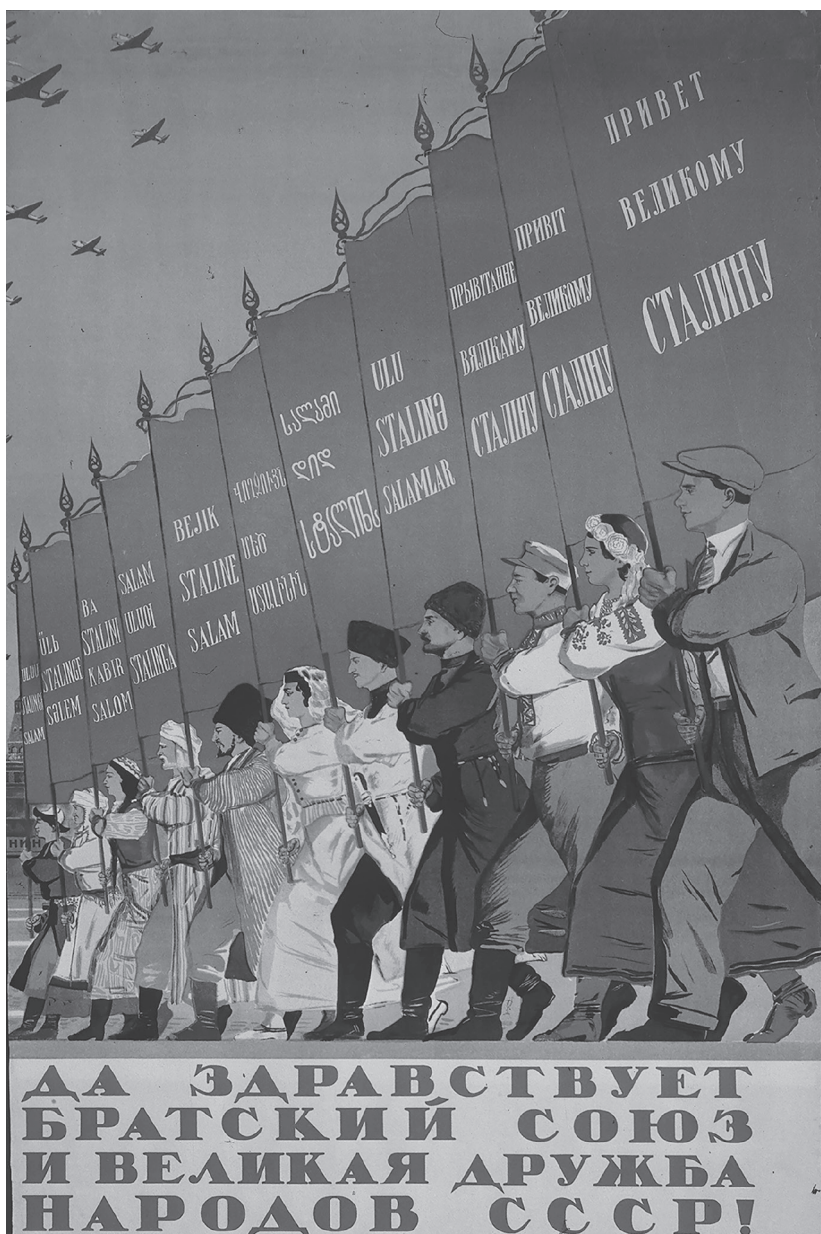
FIGURE 1.1 “Long Live the Fraternal Union and Great Friendship of Peoples of the USSR!” Soviet poster illustrating “national form, socialist content” (1936).