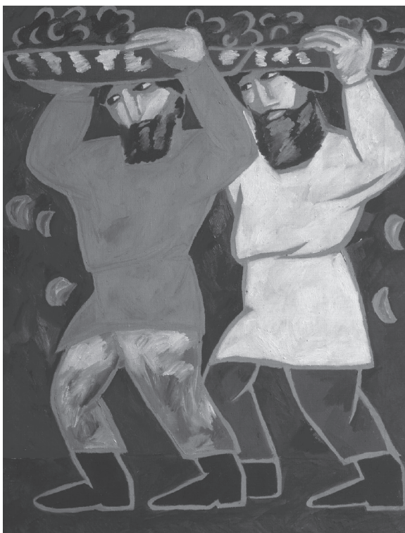
FIGURE I.5 Natal'ia Goncharova, Peasants (1911).