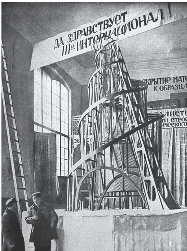
FIGURE 1.2 Vladimir Tatlin beside his Monument to the Third International (1920).