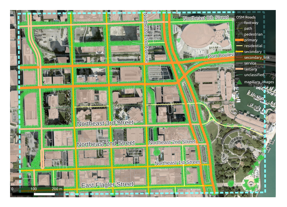
{\bf Fig.\,1.} OpenStreetMap roads and Mapillary images in the study area near Downtown Miami

researchers, including the geographic information science (GIScience) community, have been trying to understand the potential role of AI for research, teaching, and applications. ChatGPT can be used extensively for Natural Language Processing (NLP) tasks such as text generation, language translation, writing software code, and generating answers to a plethora of questions, engendering both positive and adverse impacts [2]. The emergence of generative AI has introduced transformative opportunities for spatial data science. In this paper, we explore the potential of generative AI to assist human cartographers and GIS professionals in increasing the quality of maps, using OSM as a test case (Figure 1).