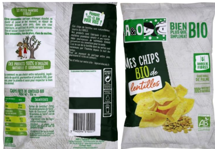
Figure 1. A & O Organic Lentil Chips

About two-thirds through our first-semester French course, we have a chapter on food, French cuisine, and grocery shopping. My students find images of packaged goods from French grocery-store websites and read the labels. A consideration of product packaging helps students work with the chapter’s vocabulary while also getting them to think about advertisement and word choice. Organic products work particularly well because companies often define their ethical practice and insist on the quality of their ingredients. These are features students notice, even at an introductory French 1 level. Together, we carefully read the back of a chip bag, examining its message (see Figure 1: the mantra “être ensemble, rien de plus, rien de moins”; the detailed health benefits “pourquoi est-ce bon pour vous?”). Next, students create a short blurb in French for the back of a cereal box or for a bag of chips or candy.