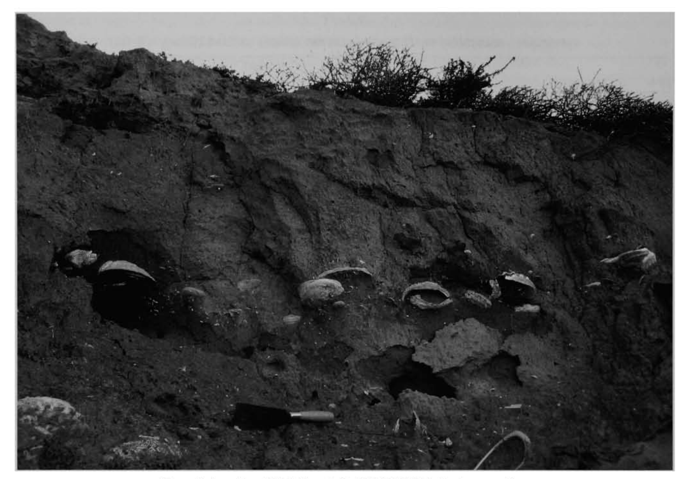
Figure 2. Location of Bulk Sample 1 at CA-SMI-657 prior to excavation.

unpublished data are also available in Walker and Snethkamp 1984, from CA-SMI-492; see Table 1). The remaining eleven sites have been identified as red abalone middens, based on the density and size of red abalone shells in site exposures. While most of the red abalone middens have been described as thin lenses (less than 30 cm. thick) of mostly large red abalone shells, a quantification of their midden constituents is necessary to understand their variability across time and space. For example, Glassow's (2005) analysis of several red abalone middens on Santa Cruz Island demonstrated that California mussel dominated the dietary meat weight represented by the assemblages. It is uncertain if similar patterns also occur on San Miguel Island.