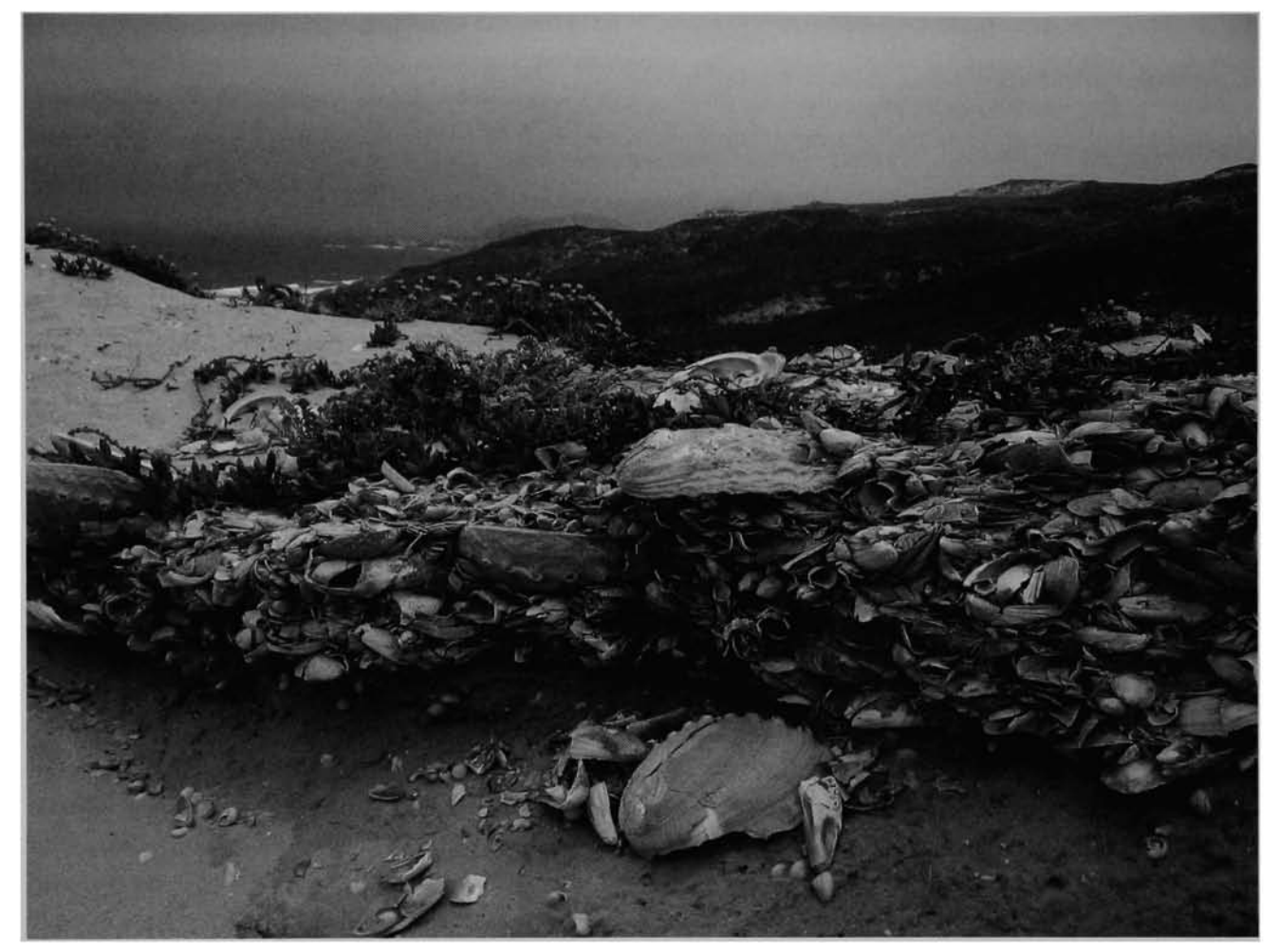
Figure 4. Location of Bulk Sample 1 at CA-SMI-396 prior to excavation.

Subsistence patterns at my study sites may also relate to temporal variability. CA-SMI-657 and -557 date to between about 6,600 and 6,000 years ago. These sites are some of the oldest <sup>14</sup>C dated red abalone middens from the northern Channel Islands. If it was during this interval that large red abalone first became abundantly available to island foragers, as a result of climate change (Glassow 1993; Glassow et al. 1988, 1994), subtidal diving (Salls 1992), human over-exploitation (Sharp 2000), sea otter hunting (Erlandson and Rick et al. 2005), or some combination of these factors, we would expect to find greater percentages of red abalone shell in these middens. This pattern is found at SMI-657 and -577, where red abalone accounted for 88% and 49% of the shell weight. After red abalone became available and was exploited for a significant period of time, we would expect to see a decrease in its overall abundance within