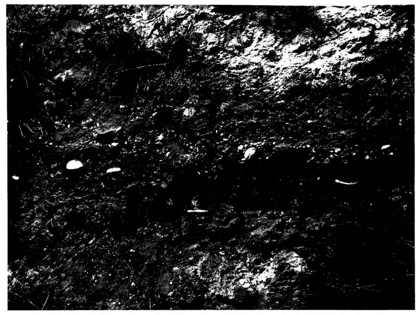
Figure 3. Location of Bulk Sample 2 at CA-SMI-557 prior to excavation; note the diverse array of shellfish taxa.

B.P. The similar vertical location, close proximity, and overlapping (two sigma) <sup>14</sup>C dates from Bulk Samples 1 and 2 suggest that the midden loci are contemporary.