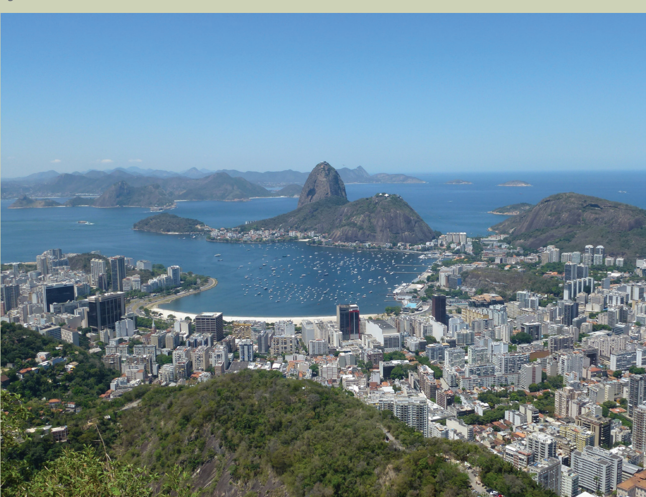
Figure 4. Rio de Janeiro from Corcavado.

Global demand for natural resources is rapidly increasing as countries seek to develop their economies and improve the living standards of their populations. Global material use tripled between 1977 and 2017, by which time it had reached 92 billion tons. Over half of this is in the form of lowcost construction aggregates rather than the more