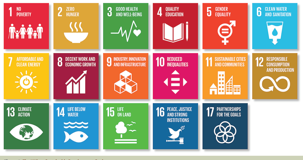
Figure 1. The UN's 17 Sustainable Development Goals.

aspects of the geosciences could help contribute to achieving many of them. The aspects included agrogeology, climate change, energy, engineering geology, geohazards, geoheritage and geotourism, hydrogeology and containment geology, and minerals and rock materials. In effect, Gill was demonstrating the importance of geodiversity to sustainable development. This idea was taken further by the Geological Society of London in producing a poster that shows how the many geoscience subdisciplines relate to the SDGs (Figure 2). But the most important publication in this regard is the book edited by Gill and Smith (2021), which has a chapter on the relevance of the geosciences to each of the 17 SDGs plus a summary chapter. Using this book as a main source, this paper aims to summarize how the geosciences have the potential to contribute to achieving these important goals. Although this paper, and indeed Gill and Smith, use the terms geoscience and geoscientists, what are really required are geopractitioners, i.e., those who have knowledge and experience in achieving better environmental outcomes from their input, rather than a purely scientific approach. As we shall see, there are strong overlaps between many of the goals, which we discuss in order below. Unfortunately, the COVID-19 pandemic has made their achievement even more difficult.