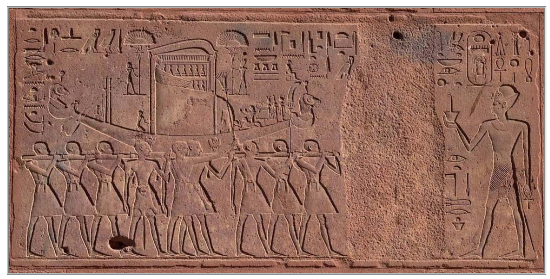
Figure 4. Hatshepsut (now hacked out) welcoming the procession, and Thutmosis III censing before the processional bark of Amun carried by priests (Red Chapel).