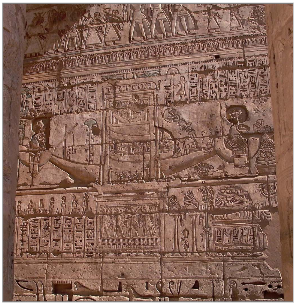
Figure 2. The processional bark of Amun Userhat (Great Temple of Ramesses III, Medinet Habu, second court).