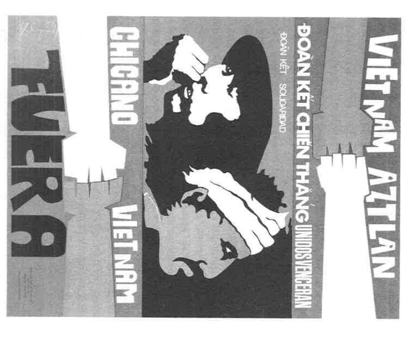
Fig. 2. Malaquías Montoya, Viet Nam Aztlán, 1972. Offset lithograph, 26 x 19 1/8 in. Courtesy of Malaquías Montoya.

Despite the consistent production of the Vietnamese as a political double, another image of identity emerged in Chicana/o culture during this period, and more popularly so: the Aztec Indian. During the 1970s, widespread formulations of Chicana/o identity imbued with indigenous cultural pride