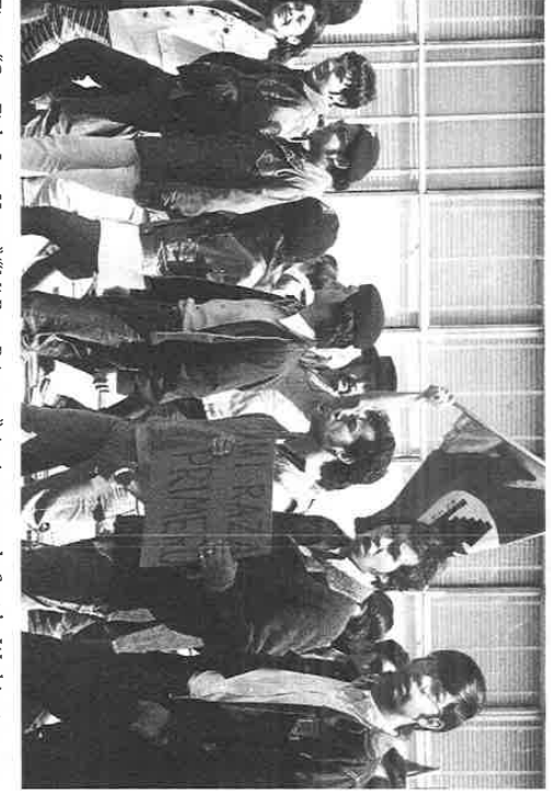
Fig. 3. "Our Fight Is at Home"/"Mi Raza Primero." Antiwar march, Seattle, Washington, ca. 1971.