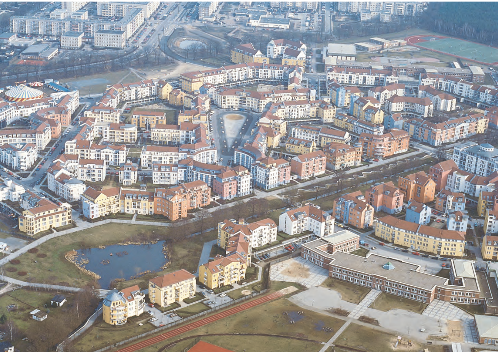
Aerial photo, showing central axis and Hirtengraben Park