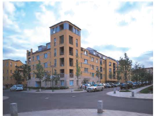
Corner tower type