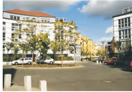
Mid-block apartment building