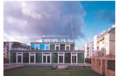
Day care center