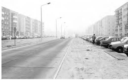
Plattenbau, housing built under the former German Democratic Republic near Kirchsteigfeld

ronment that demanded high-quality construction, pedestrian and bicycle paths, and a sensitive approach to the local ecology does not exist in the United States. Moreover, the combination of public and private funding that built Kirchsteigfeld (though considered in Germany to be a significant example of privatization) would be unthinkable in the U.S., where no public agency would lavish so much money on middle-class housing. Nor would a local American government be likely to contribute a streetcar, as happened here.