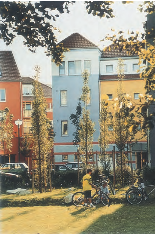
Hirtengraben Park, detail