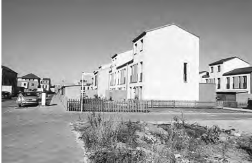
The rowhouses the developer has recently substituted for the apartment blocks called for by Krier and Kohl have an awkward relationship to the street, with small front gardens that correspond more to the usual backyard, complete with sliding glass doors and gardening shed.

any of the courtyards, where prominent signs forbade dogs, soccer balls and bicycles—three staples of German recreational activities.