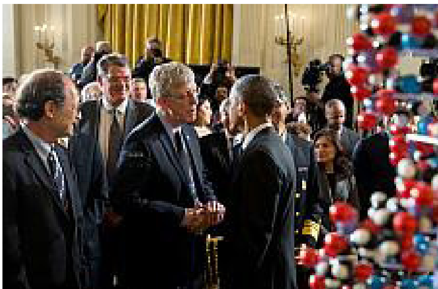
Figure 2. President Barack Obama shakes hands with the Director of the National Institutes of Health, Dr. Francis Collins, after his remarks on the Precision Medicine Initiative on January 30, 2015. 20

Another complication to this testing approach is that the PM movement has the potential to misrepresent certain groups. According to recent analysis, patients of European ancestry are disproportionately represented in genetics testing, which makes it harder for scientists to analyze diseases in other populations. 14 From these results, the precision medicine movement may have a Eurocentric bias that requires more testing from outside populations in order to paint a more accurate picture of many different types of human disease across the globe. Additionally, such mo-