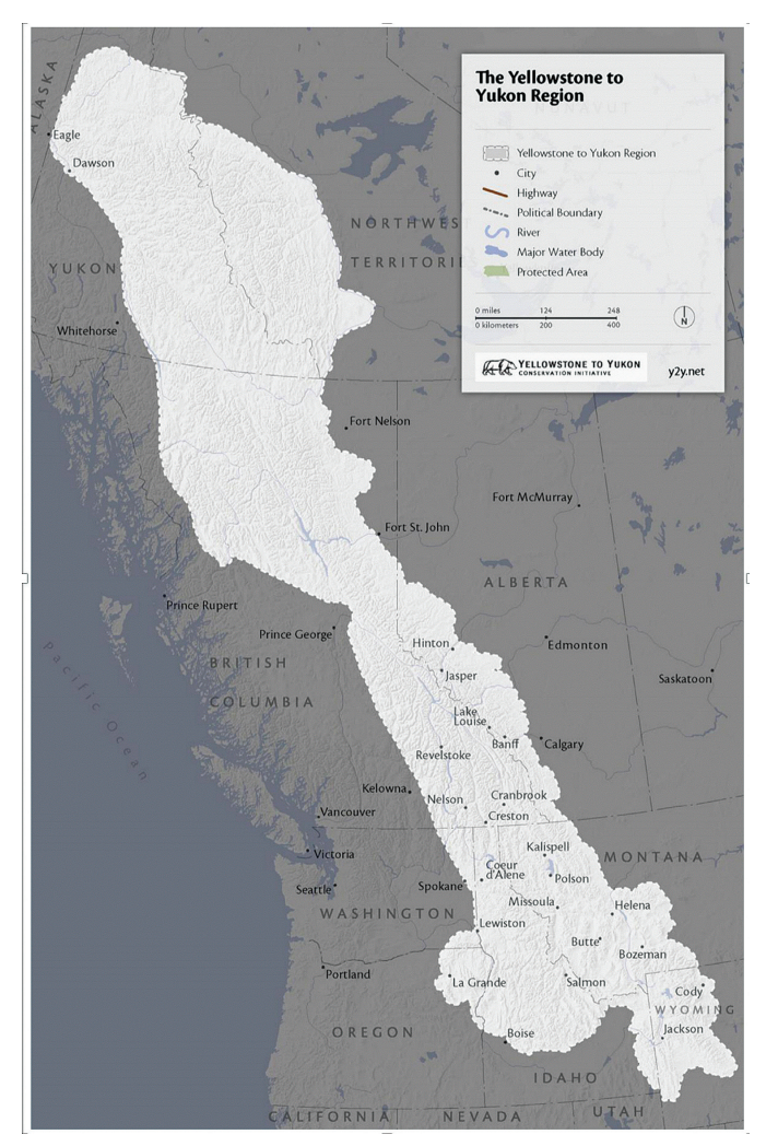
FIGURE 3. The Yellowstone to Yukon Region. Adapted from Chester 2003.

stress the efforts already in place to encourage sustainable harvest of resources and which regard human populations as part of the healthy ecosystem, rather than as a competitor to it (Chester 2003).