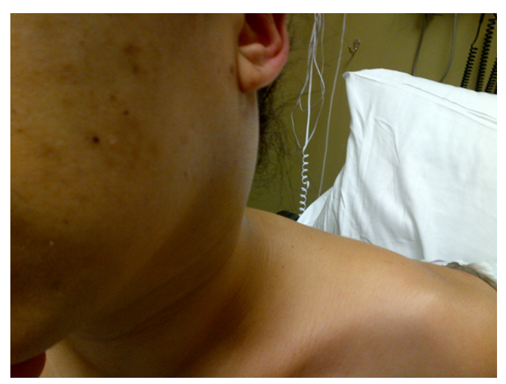
Figure 1. Large mass on left lateral neck.

Early recognition and treatment are crucial as the mortality rate in untreated individuals approaches 17%. Antibiotic treatment should include intravenous anaerobic coverage with metronidazole or clindamycin which can be transitioned to oral with minimum treatment duration of 3 weeks. Anticoagulation in Lemierre's syndrome remains controversial but should be considered if thrombosis extension is noted clinically.<sup>2</sup> The imaging modality of choice is a contrast enhanced CT of the neck. Radiologic findings include intraluminal venous filling defects and peripheral rim enhancement of the involved segment which can measure 10-20 cm in length and most frequently includes complete occlusion.<sup>3</sup>