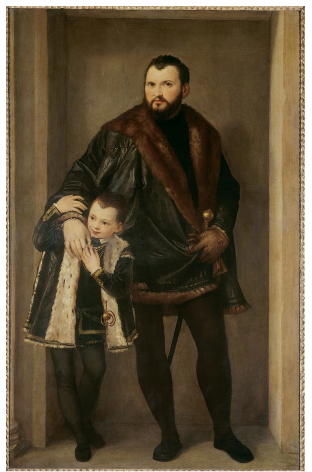
Fig. 12: Veronese, Portrait of Giuseppe Da Porto with his Son Adriano, c. 1551, oil on canvas, 207 x 136 cm, Uffizi Gallery.