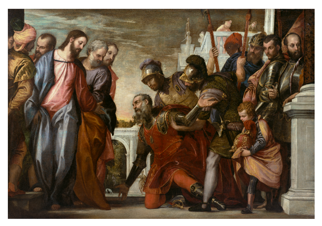
Fig. 6: Veronese and workshop, Christ and the Centurion , c. 1571, oil on canvas, 55 3/8 x 81 1/8 inches (140.6 x 206.1 cm), The Nelson-Atkins Museum of Art, Kansas City, Missouri, Purchase: William Rockhill Nelson Trust 31-73

As his Marriage Feast at Cana shows, Veronese often depicted contemporary dress in his large Biblical canvases. A second example is Christ and the Centurion (Figure 6).<sup>23</sup>