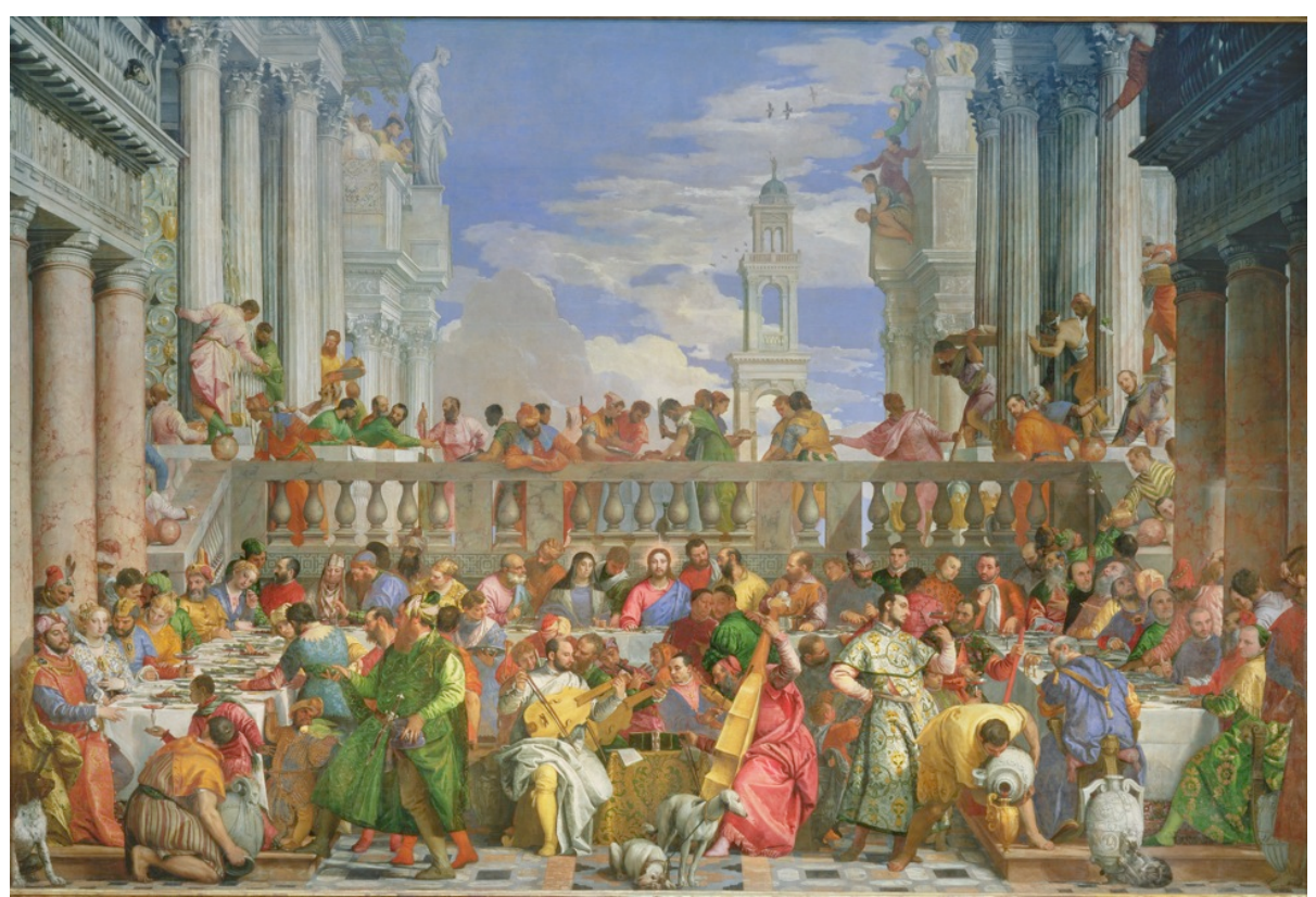
Fig. 4: Veronese, Wedding Feast at Cana , 1562-3, oil on canvas, 6.77 x 9.94 m, Louvre, Paris, France

Veronese was said to have dressed well himself. Ridolfi wrote that though he generally spent little, "he habitually wore expensive clothes and velvet shoes"<sup>14</sup>—a remark affirmed by the beautiful clothing the painter depicts in his 1562-3 Marriage Feast at Cana , painted for the Benedictines at San Giorgio Maggiore and now in the Louvre (Figure 4).<sup>15</sup>