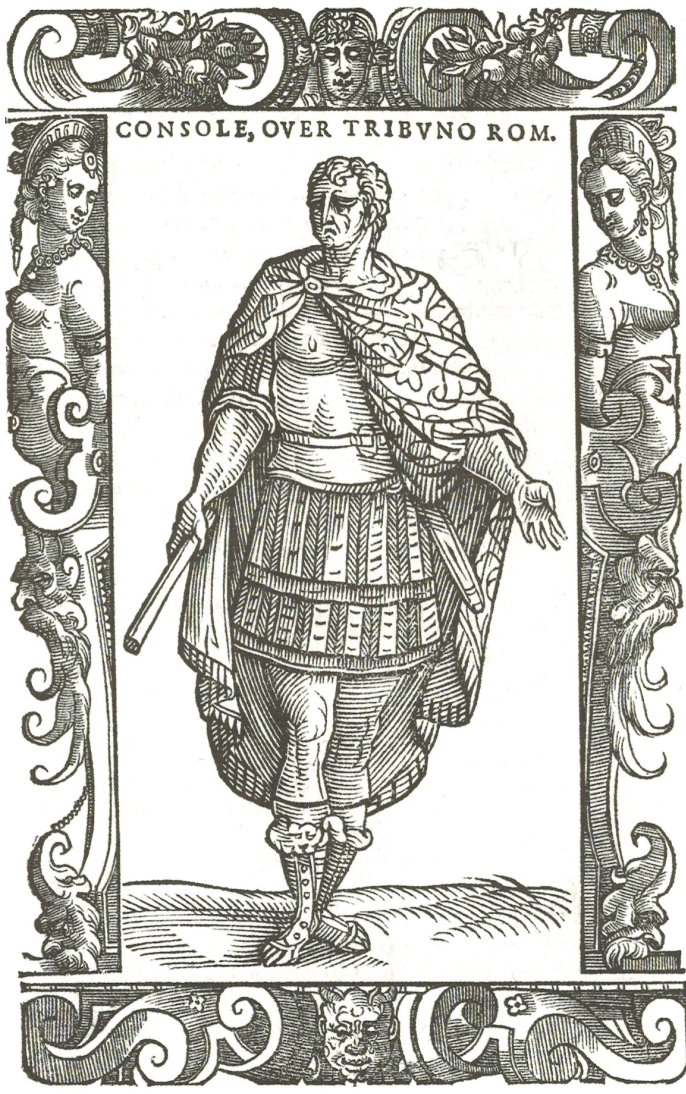
Fig. 8: Cesare Vecellio, Consul, or Roman Tribune, in Habiti antichi et moderni di diverse parti del Mondo, 1590, woodcut, 15.5 cm x 6 cm, Private collection, Massachusetts

The medium in which Veronese represents this self-humbling Christian's clothing—a canvas 6 <sup>3</sup>/<sub>4</sub> feet wide, 4 <sup>3</sup>/<sub>4</sub> feet high, and loaded with color—is very different from Vecellio's much smaller black and white woodcut, which is only 4 inches wide, including the frame, and 6 inches high (Figure 8).