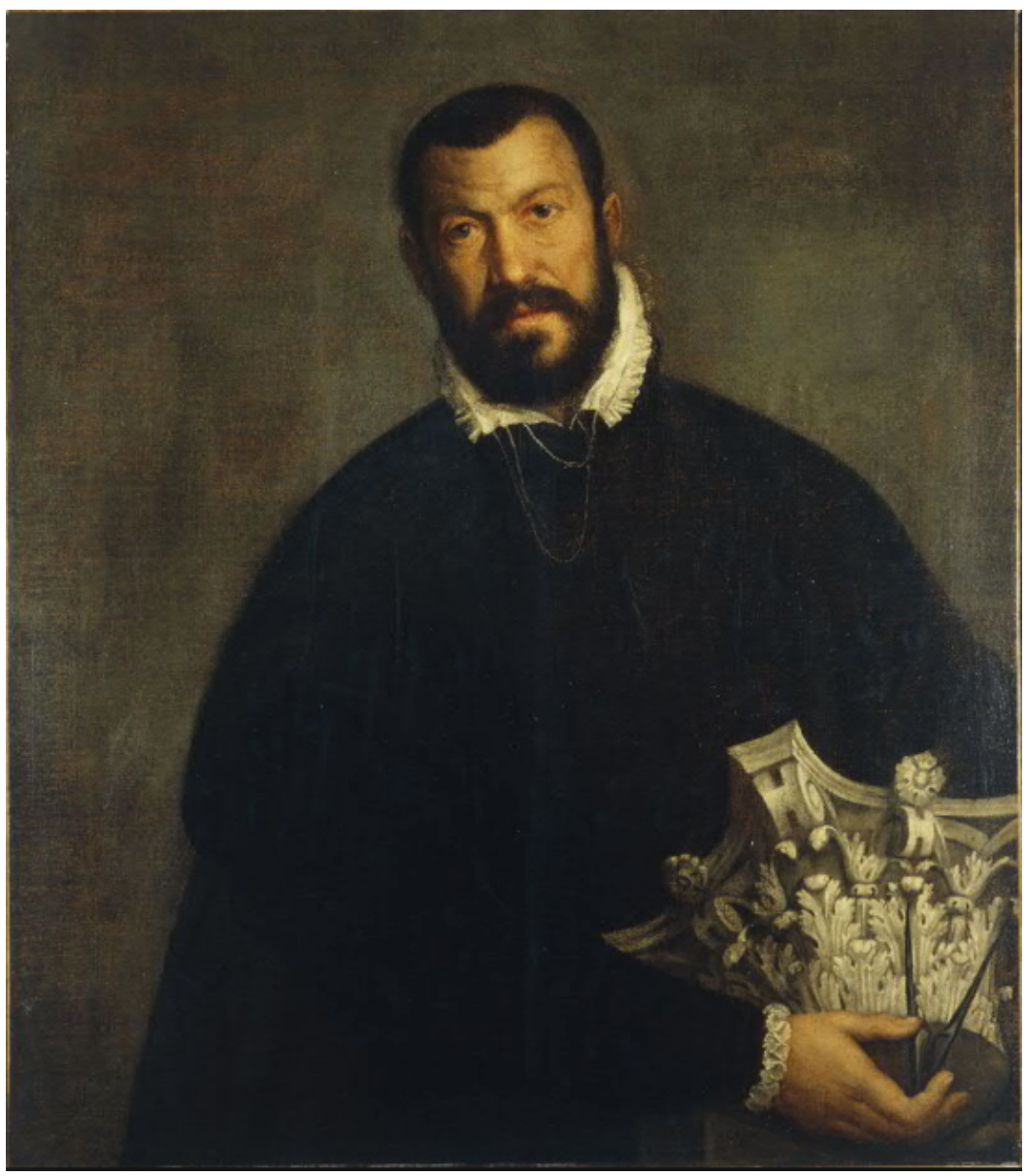
Fig. 13: Paolo Veronese and Workshop, Portrait of Vincenzo Scamozzi, oil on canvas, 93.5 x 82 cm, mid-1580s, Denver Art Museum

Veronese's treatment of Scamozzi's plain black gown focuses the viewer's eye first on the architect's face, then briefly on his modest white chemise collar and almost invisible chain necklace, and then on the Corinthian capital and compass in his hands. We look at the tools of his profession rather than the splendor of a nobleman's gold-trimmed jacket.