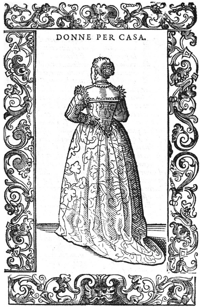
Fig. 21: Cesare Vecellio, Donne per Casa , woodcut, Habiti antichi et moderni , 1590, folio 139, Private collection, Massachusetts

We see the noblewoman from behind, in a snugly fitted bodice with a slightly dropped waist and a full, gathered skirt of brocade long enough to flow into a train.