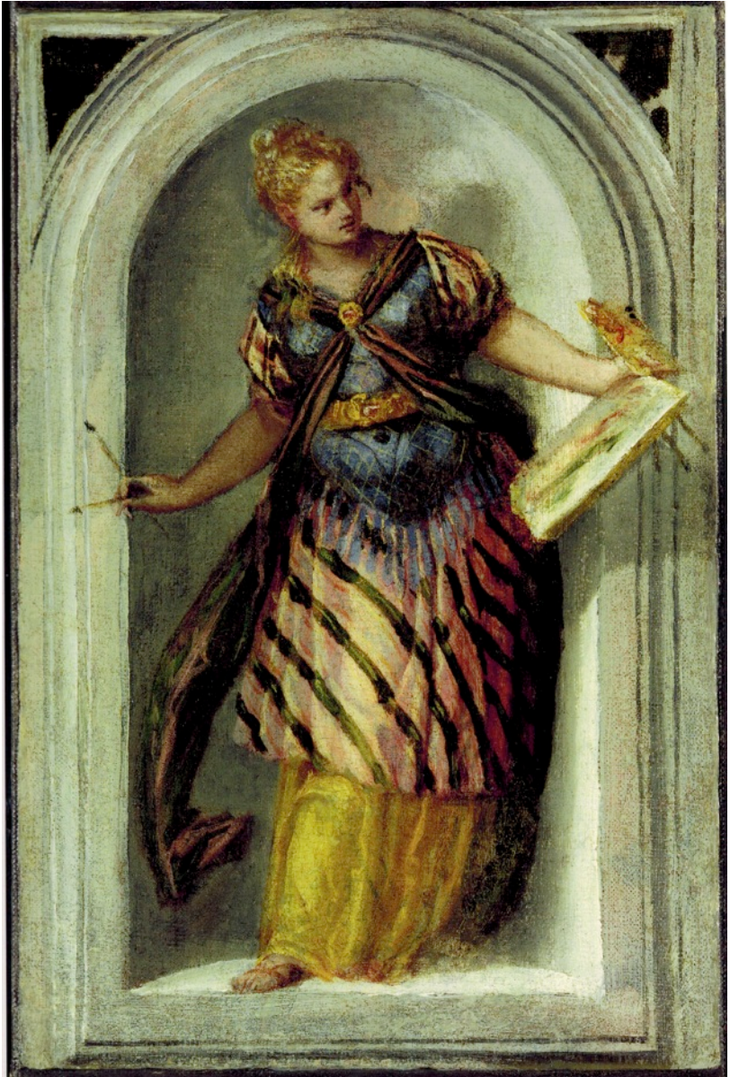
Fig. 9: Paolo Veronese, The Muse of Painting [ Allegory of Painting ], 1560's, oil on canvas, 38.7 x 28.9 cm, Detroit Institute of Arts, USA / Gift of Mr. and Mrs. Edgar B. Whitcomb

Even in his paintings of imagined figures, Veronese depicted actual Venetian fabrics, which he combines in his Allegory of Painting (Figure 9):