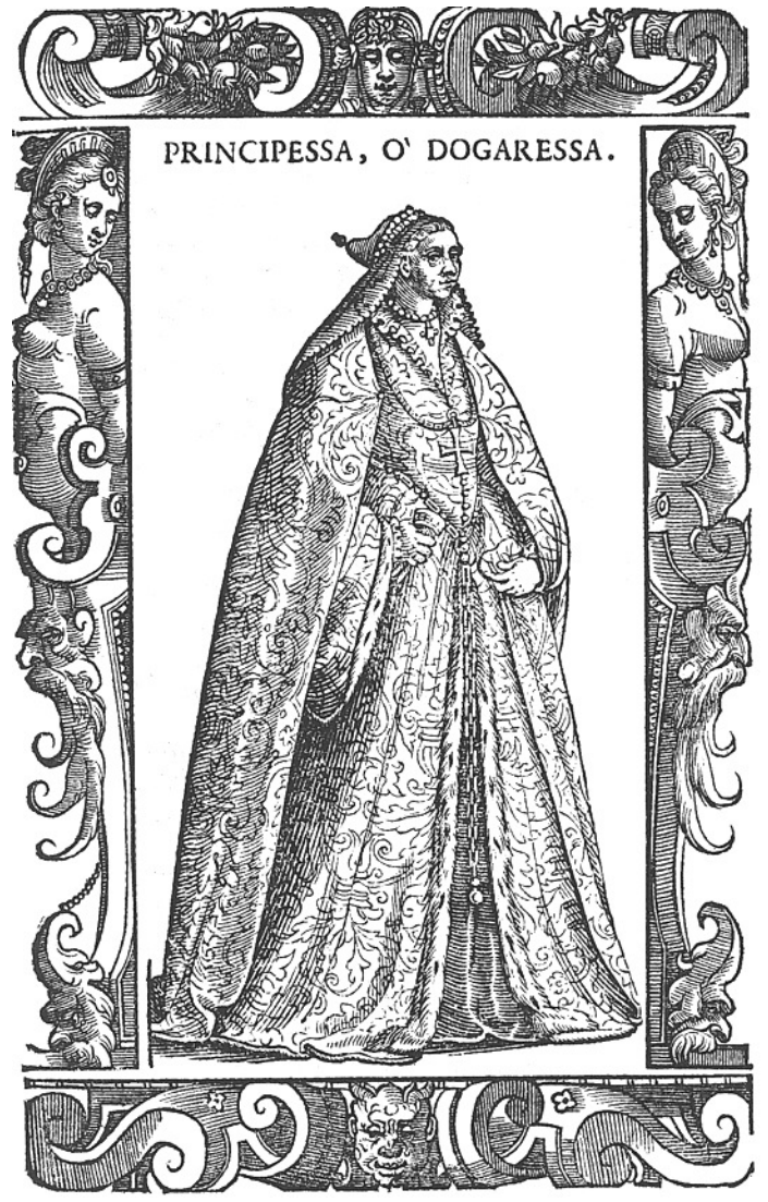
Fig. 17: Cesare Vecellio, Principessa, ò Dogaressa, woodcut, Habiti Antichi et moderni, 1590, 80, Private collection, Massachusetts

[l]a Principessa era vestita alla Ducale, con una vesta di broccato d'oro fino, sopra la quale portava il manto lungo fino in terra [...]. Il Corno, ch'ella haveva in capo, era tempestato d'assai gemme, & era accompagnato da un sottilissimo velo di seta [...] tutto trasparente [...]. Al collo havea una filza di perle di grandissima valuta, ma più d'ogni altra cosa fu mirabile una gioia di prezzo inestimabile, che pendeva fino al petto da una collana d'oro tramezata di molte altre gioie (80-1).