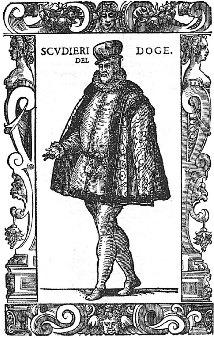
Fig. 16: Cesare Vecellio, Scudieri del Doge , woodcut, Habiti antichi et moderni , 1590, folio 115, Private collection, Massachusetts

He also describes the dress of the dogaressa herself and provides a detailed woodcut portrait of her, though the written description is more informative than in the black and white print (Figure 17):