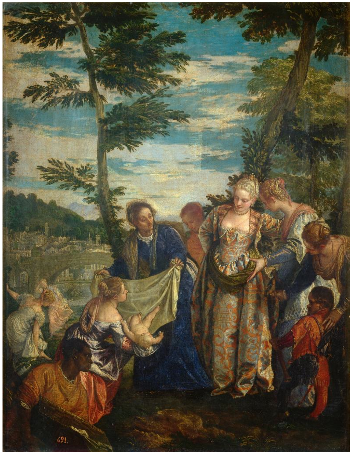
Fig. 20: Paolo Veronese, Finding of Moses [Moses Saved from the Water ], ca. 1580, oil on canvas, Prado Museum