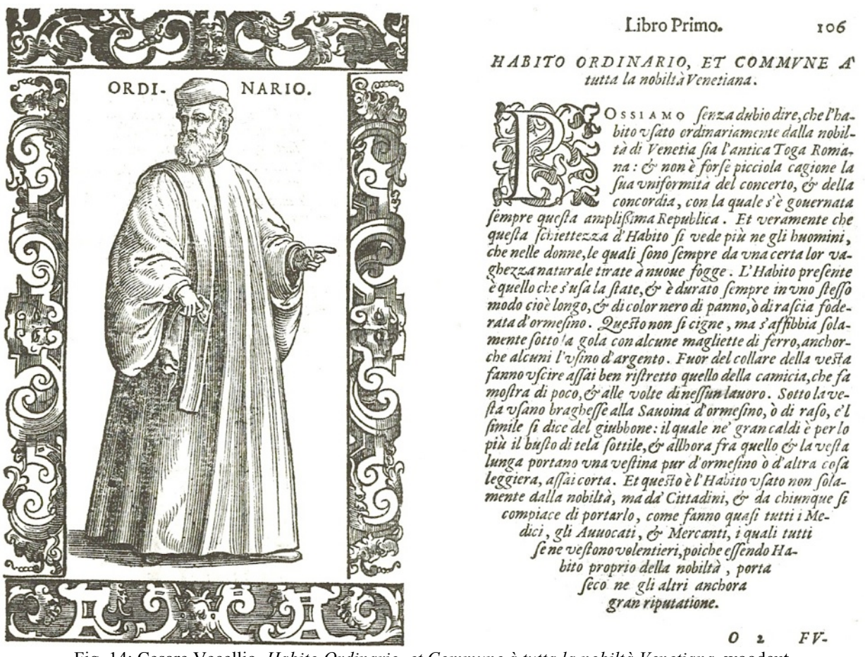
Fig. 14: Cesare Vecellio, Habito Ordinario, et Commune à tutta la nobiltà Venetiana, woodcut, Habiti antichi e moderni, 1590, 106, Private collection, Massachusetts

Vecellio shares this view of black, which he shows in a print entitled Everyday Clothing Worn by the Entire Venetian Nobility and succinctly describes in his text (Figure 14).<sup>58</sup>