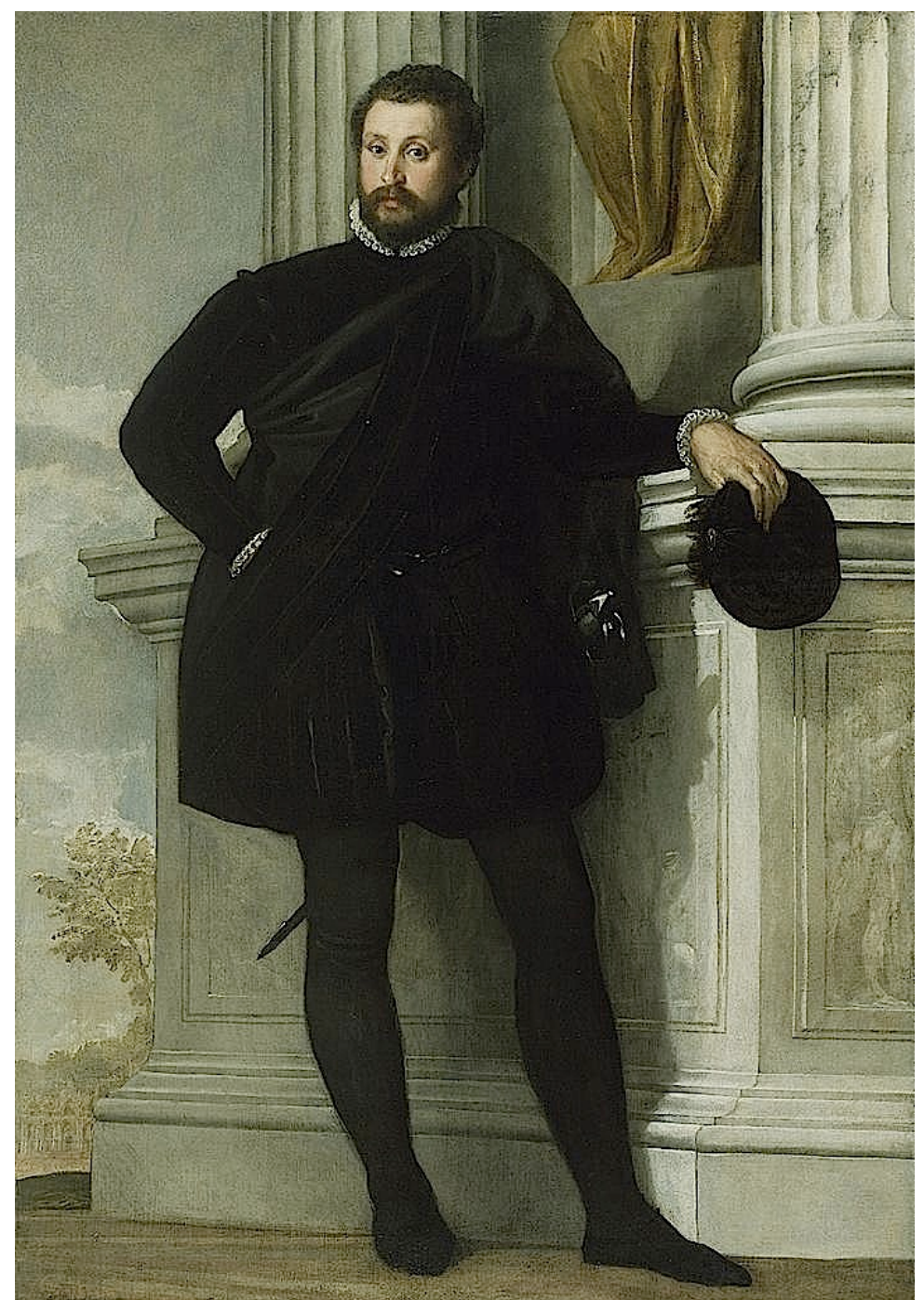
Fig. 15: Paolo Veronese, Portrait of a Man , 1576-78, oil on canvas, 192.1 x 134 cm, Open Content, J. Paul Getty Research Institute

Living in a city in which magistrates were required to wear black robes and men of all ages wore it as a sign of dignity, Venetians, including artists, developed a discerning eye for the hues and qualities of panni neri . An early painting demonstrating the importance of black is Sebastiano