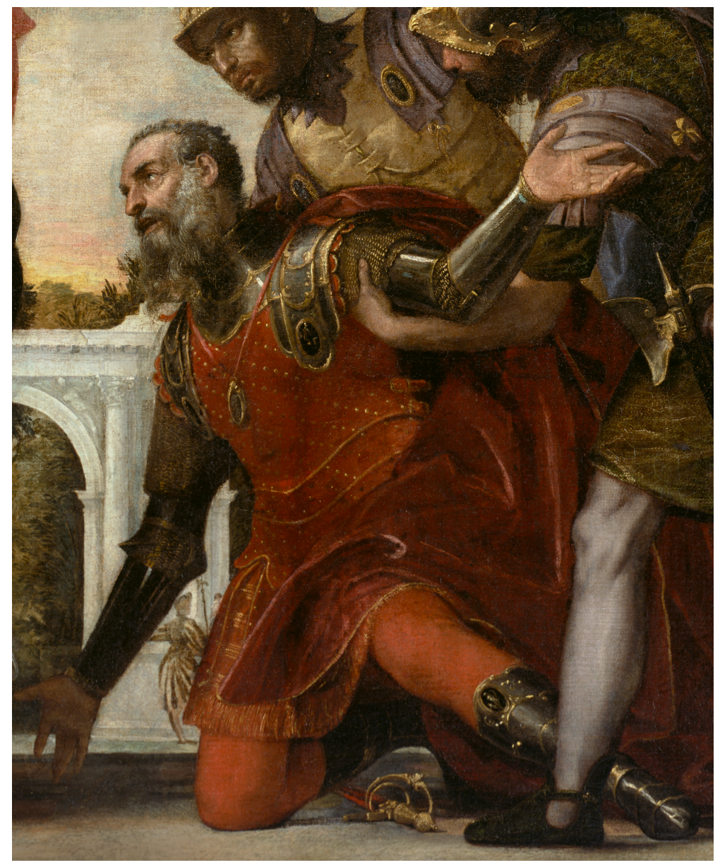
Fig. 7: Veronese and workshop, Christ and the Centurion , detail, The Nelson-Atkins Museum of Art, Kansas City, Missouri, Purchase: William Rockhill Nelson Trust 31-73, Photo: Melville McLean

Veronese's wealth of pigment, a visual analogy to Vecellio's language of color, signals the willingness of this powerful soldier to kneel to the young man he has accepted as the son of God. Veronese makes this point visually through the contrast between the humility of the centurion's kneeling pose and the splendor of his dress, grounding the miracle in a precise rendition of the rich dyes and fabrics named in Vecellio's text, which their fellow citizens would recognize as those worn by a wealthy man of the present (Figure 7). Expensive reds, as we will see, were reserved for the gowns of patricians.<sup>25</sup>