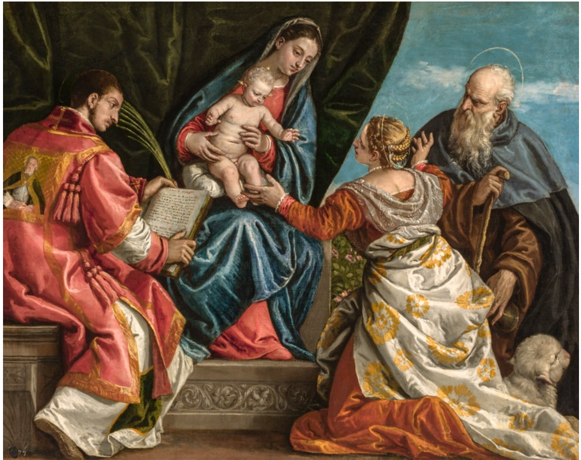
Fig. 18: Paolo Veronese, Sacra Conversazione , 1560s, oil on canvas, 103.2x 127.7 cm, The New Orleans Museum of Art: The Samuel H. Kress Collection, 61.80

Second, her intricately braided blond hair is trimmed with pearls falling in a loop around and below her ear. Coiffures in which braids were woven with strands of pearls, gems that Venice famously imported from the East and sold to the rest of Europe, were themselves a fine art. Giovanni Guerra illustrated such styles in the forty-five engravings in his book, Various Coiffures Worn by the Noblest Ladies of Various Cities of Italy , published in the 1590s.<sup>74</sup> One of Guerra's prints, "La Ornata" of Milan, resembles Veronese's Venetia : she wears a long strand of