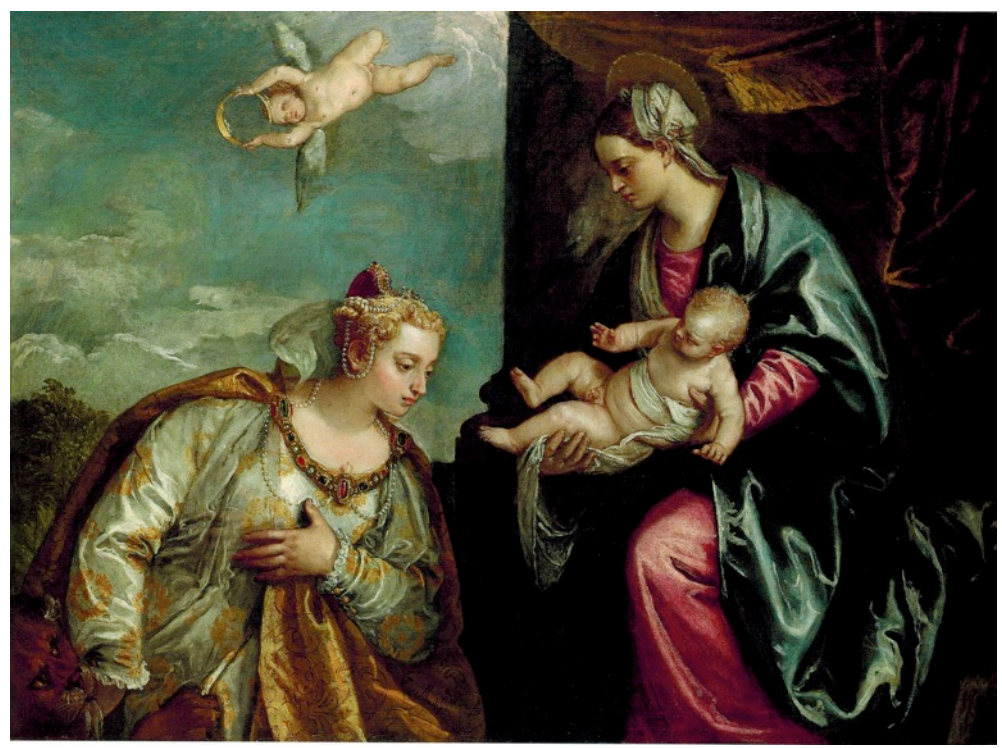
Fig. 19: Paolo Veronese, Allegory of Venice Adoring the Virgin and Child , late 1570s, oil on canvas, 103 x 139 cm, Private collection, Wikimedia Commons

small pearls twisted through her braids, encircling her neck, looping down to her collarbone, and framing her ear from below.<sup>75</sup> Veronese's Venetia also wears a long strand of smaller pearls, pinned up at the middle of her bodice below the heavy jeweled necklace attaching her mantle. Third, under the gold-on-gold brocade of her cloak, she wears a gown of white satin brocaded in gold.