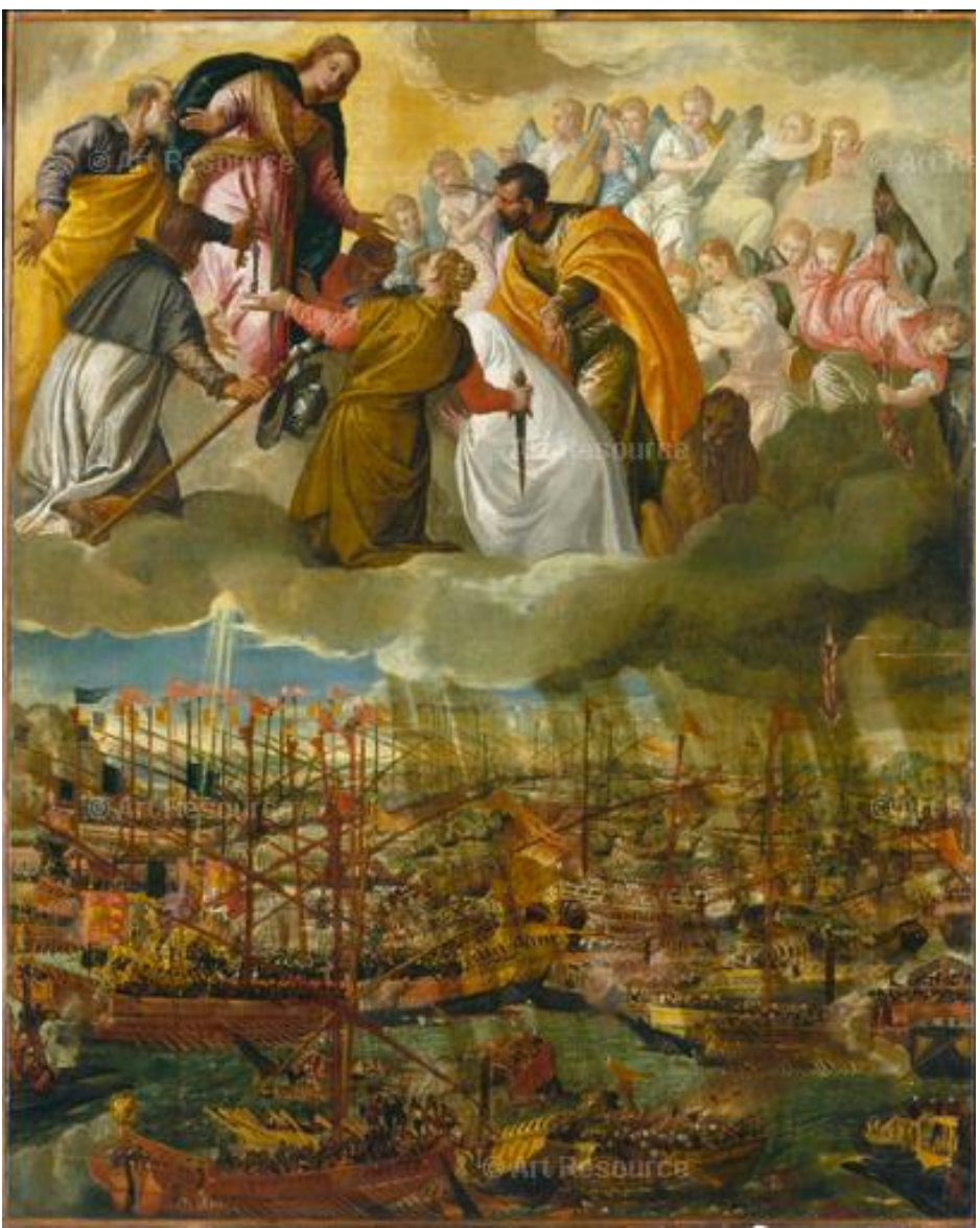
Fig 1: Paolo (Caliari) Veronese, Allegory of the Battle of Lepanto , c. 1573, oil on canvas, 169 x137cm, Gallerie dell'Accademia, Venice

to religious and secular history, mercantile wealth, patrician luxury, and civic harmony in order to affirm the commercial and political ideologies of their city.<sup>6</sup>