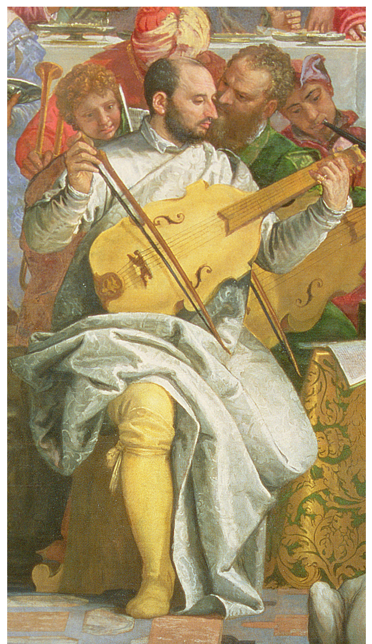
Fig. 5: Veronese, Wedding Feast at Cana, detail

In the midst of the striped and gold-woven Eastern silks and the patterned Venetian brocades, painted, as Richard Cocke puts it, with Veronese's "customary mastery" of such textiles,<sup>16</sup> Veronese shows himself in a presumed self-portrait as the viola da gamba player in a group of