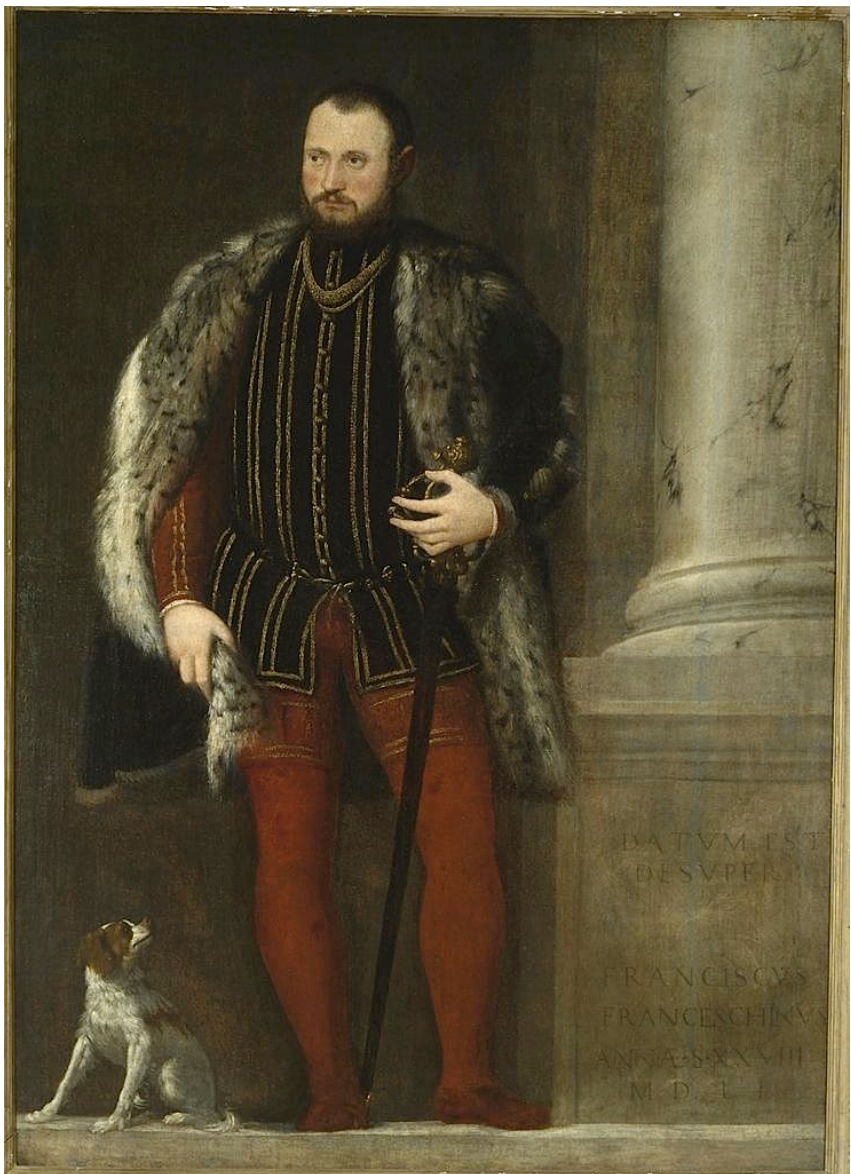
Fig. 11: Paolo Veronese, Francesco Franceschini , 1551, oil on canvas, 189.5 x 134.9 cm, John and Mable Ringling Museum of Art, Sarasota, Florida

In Veronese's portraits of Venetians, his treatment of what they are wearing