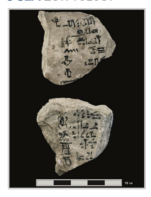
Figure 1. Ostracon TT99, obverse (top) and reverse (bottom), showing two lists of foreign words written in Group Writing.

pronounced is perceived as crucial—would be obvious contexts in which to deploy orthographic subsystems ensuring more accurate renditions of words (see also Kilani 2021: 16-18 for similar considerations). However, it is advisable to exercise caution in drawing conclusions here. In particular, if the magical context was the main reason to spell foreign sentences in Group Writing, then we could expect foreign sentences attested outside magical contexts to be spelled in less distinctive ways. This is not the case: even the (few) instances of non-magical foreign sentences are spelled in Group Writing (see, e.g., the Canaanite sentence in Pap. Anastasi I 23:5, mentioned above). This might suggest that the use of Group Writing was primarily dictated by some features related to the foreign origin of the utterances being transcribed, rather than by their magical v. non-magical nature.