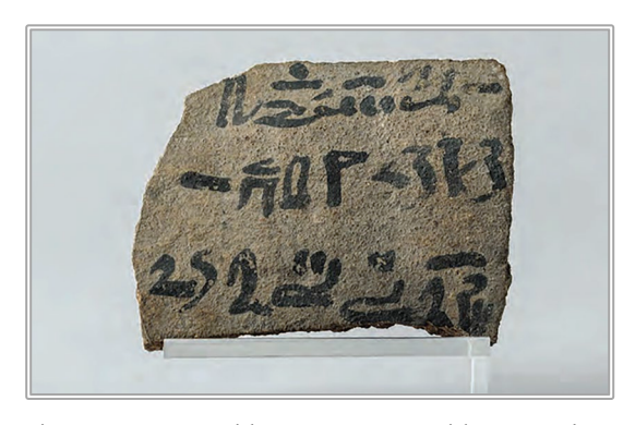
Figure 4. Ramesside ostracon with oracular question (O. Turin CGT 57227). The negation billion in the first line is written in Group Writing.

assumed that its primary function was specifically to write such foreign terms. However, as noticed by various scholars, the evidence tells a different, more complex story. Although foreign words and names indeed constitute the lion's share of terms spelled in Group Writing, it is undeniable that a large number of purely Egyptian terms were also regularly transcribed in Group Writing (Quack 2010: 81; Winand 2017: 506-507), including Egyptian place names (e.g., "Ermont" (18) Lii Wille), particles (e.g., Se Di = "focalizing particle"), prepositions (e.g., "who"), verbal morphemes (e.g. prefix ), fig. 4), and even words attested in traditional orthography in previous periods (e.g., \stackrel{?}{\sim} 1? = a kind of goose, attested in the Old Kingdom as ). The use of Group Writing was thus not (only) dictated by an Egyptian v. non-Egyptian opposition.