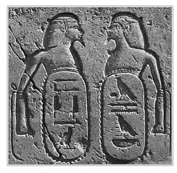
Figure 3. Two Levantine toponyms written in Group Writing, from the topographical list of Thutmose III at Karnak.

Personal names and toponyms spelled in Group Writing were also common in New Kingdom non-funerary religious compositions (hymns, prayers, etc.) and in celebratory texts, both royal (annals, victory stelae, etc.) and nonroyal (biographies, etc.), which were usually written in Middle Egyptian, though variously influenced by Late Egyptian (see Ahituv 1984 for a corpus of place names spelled in Group Writing also deriving from such texts; while for personal names see Schneider 1992). Foreign names were also usually written in Group Writing in topographical lists (fig. 3), common in royal monuments of the time (Simons 1937). Therefore, in principle Group Writing is not intrinsically incompatible with Middle Egyptian.