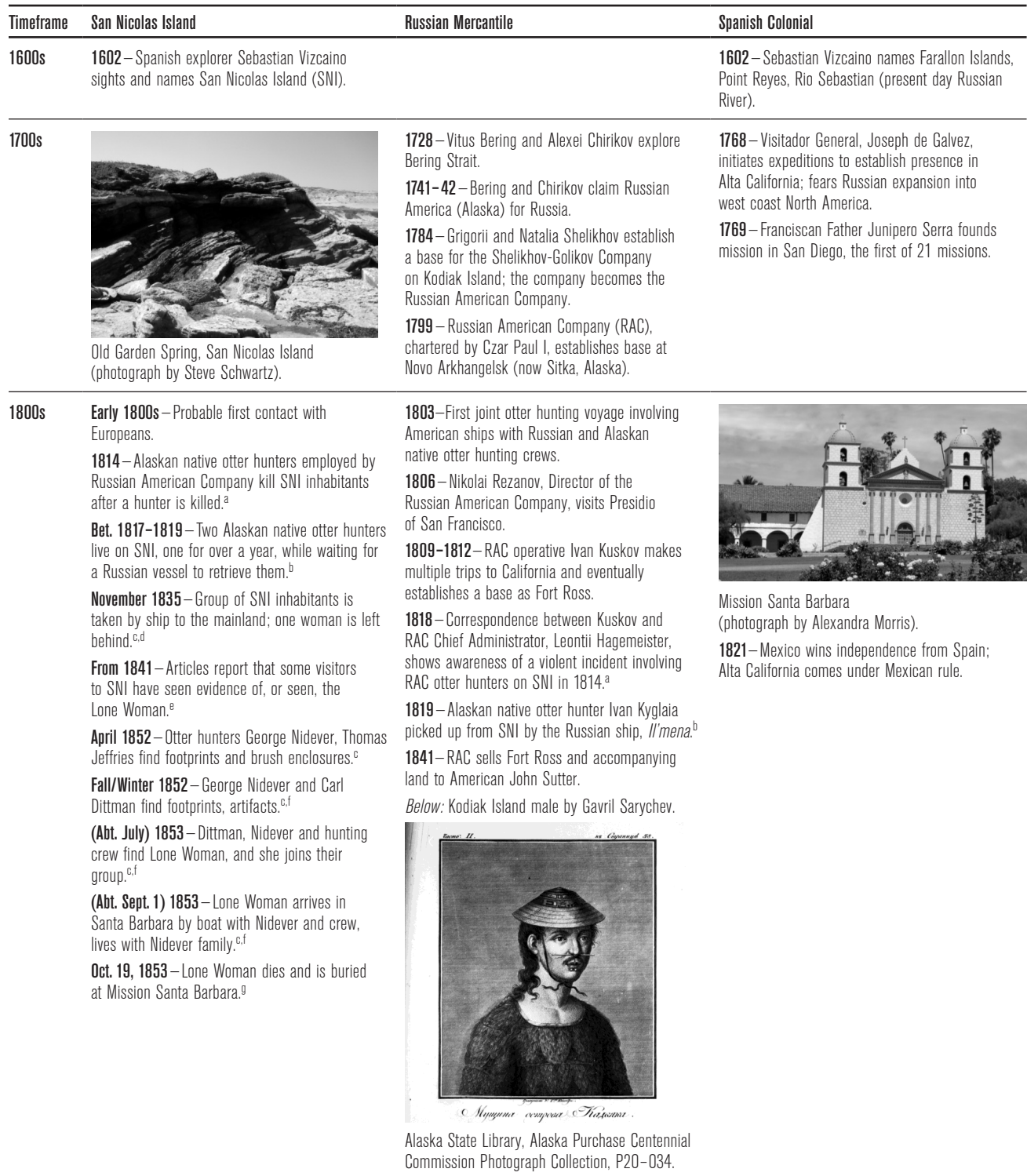
Alaska State Library, Alaska Purchase Centennial Commission Photograph Collection, P20–034.