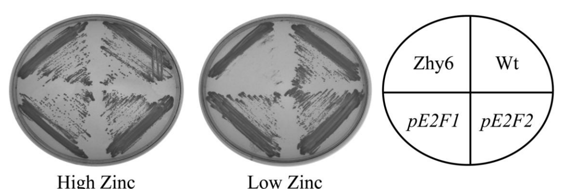
Figure 2: Expression of the T. caerulescens transcription factors, TcE2F1 and TcE2F2 , in the yeast mutant \Delta zap1 , restores the ability of the yeast to grow on low Zn.