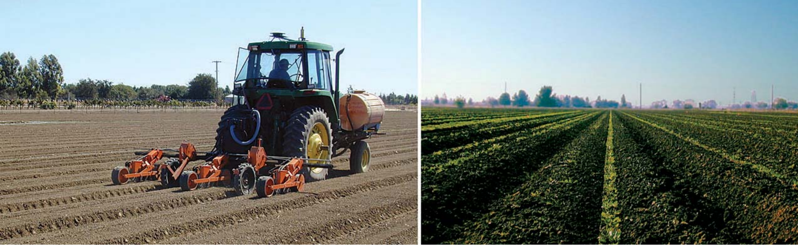
Processing tomato seeds are planted using an autoguidance system. In two trials, total plant damage was 2% and zero when the autoguided cultivator was operated at 7 miles per hour and 2 inches from the plant line.