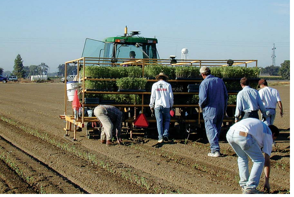
Ultraprecise global positioning systems (GPS) are now available that can guide tractors at high speeds in agricultural fields, running to within inches of plants with very little damage. Above , at UC Davis, tomato seedlings are transplanted using an autoguidance system. The GPS unit is on top of the tractor cab. Left , drip tape is installed at the same time.