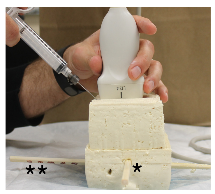
Figure 3. Difficult phantom model with hand-on-syringe approach. The simulated phantom model employed two sections of extra-firm tofu (10 by 8 by 4cm). Two wooden dowels were inserted through the tofu in perpendicular orientation to reflect a modeled nerve (*) and vessel (**). The modeled vessel was deeper and adjacent to the modeled nerve.

The HS technique would be much more appealing in the ED environment, using a commonly available control syringe to retain tactile feedback.