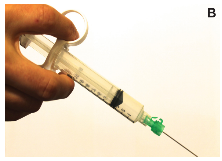
Figure 1. A, Hand-on-needle technique has the provider holding the needle hub in a pencil-like fashion while resting their hand on the body surface. B, Hand-on-syringe technique has the operator hold the syringe rather than the needle, enabling them to aspirate and inject local anesthetic without the use of an assistant.

this technique requires a second operator to inject the anesthetic and also results in the primary operator losing the tactile feedback of resistance to injection. Loss of tactile feedback could potentially make it more difficult to identify a possible intraneural needle tip placement and high-pressure injection with a subsequent increased risk of peripheral nerve injury. 12,13 In contrast, the HS technique requires only a single operator to maneuver the needle while also injecting the anesthetic, obviating the need for additional personnel and allowing the operator to maintain tactile feedback throughout the procedure. The single-operator method and ability to maintain tactile feedback make the HS technique advantageous in the ED setting. Additionally, the assumption that a two-operator HN technique confers more accuracy has, to our knowledge, never been investigated.