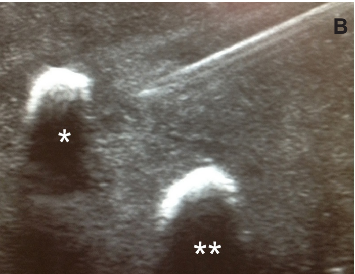
Figure 2. A, Simple phantom model made of extra-firm tofu (10 by 8 by 4cm) with two wooden dowels inserted in parallel fashion to simulate nerve (*) and adjacent vessel (**). B, Ultrasound image of simple model with modeled nerve (*) and vessel (**) with inplane needle view using a linear 12-5MHz transducer with appropriate gain and depth set by one of the study authors.