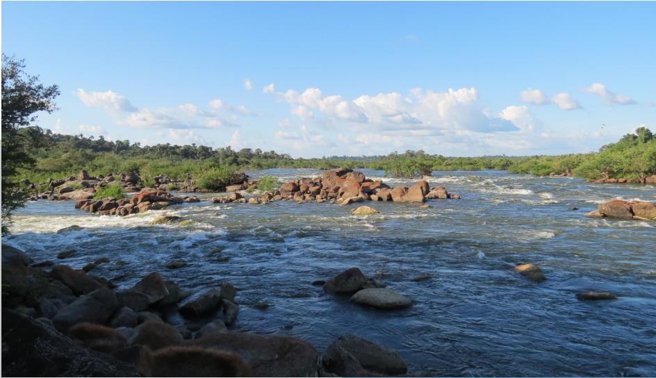
Figure 1 (left): Rapids typical of the Volta Grande, characterized by the vegetation along the banks and the huge partially submerged boulders. Fishermen find plecocs, medium-sized suckermouth catfish, wedged between crevices formed by the rocks and boulders.

after the dam's reservoir was filled in 2016. Downstream of the Belo Monte complex, researchers found that the generalist species, fish that easily adapt to immense changes in the environmental conditions of a system, replaced non-tolerant specialist species. 6 The extinction of specialist rapid-dwelling species, especially in a region where divergent evolution is highly active, will be an immense loss not only to science, but also to the fishermen and nearby cities that rely on the ornamental fish trade to drive the local economy.