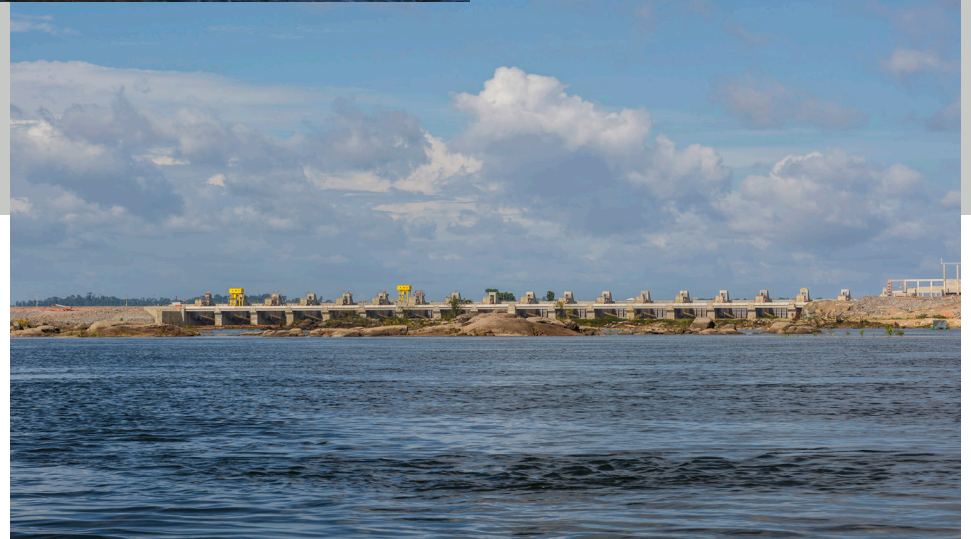
Figure 2 (right): The main dam shortly before its completion.

conditions. The dam project will damage each part of the river on which the hydroelectric complex lies: the upper section, middle section, and lower section. Upstream, the dam has already slowed the rapids, and as a result, the substrate—the river bed—will continue to erode significantly. Other effects include an increase in surface temperatures and a lower dissolved oxygen content in the water. Downstream of the powerhouse, the overall water flow will continue to decrease, and the quality of the water will worsen due to the sedimentation, erosion, and increased temperatures of the system upstream. 6 The construction of the Belo Monte dam raises several environmental concerns, as evidenced by a large decline in the populations of endemic fish.