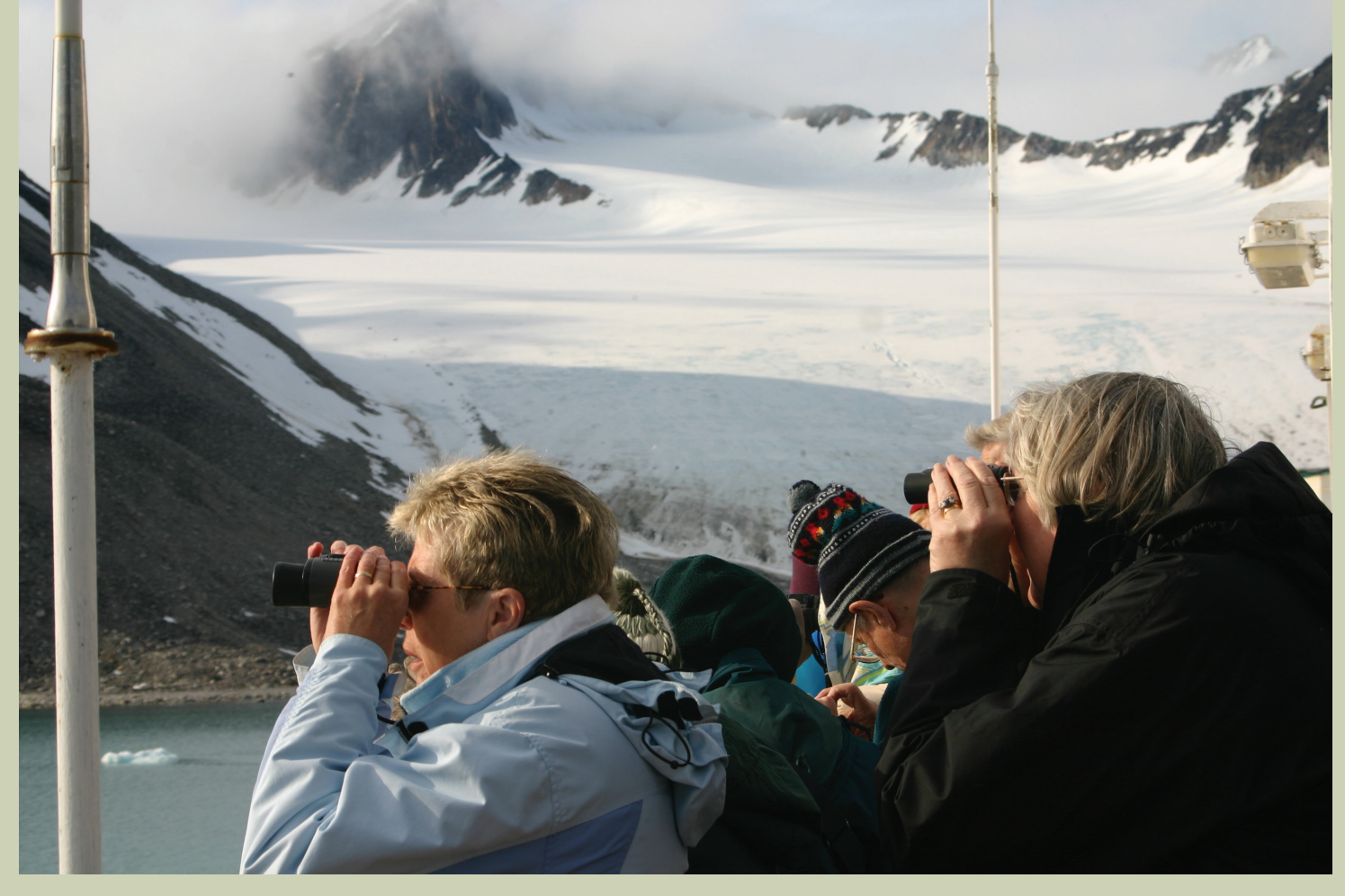
Connecting people and nature is now a fundamental part of protected and conserved areas management, as seen here at Magdalena Fjord in the Nordvest-Spitsbergen National Park, Norway.