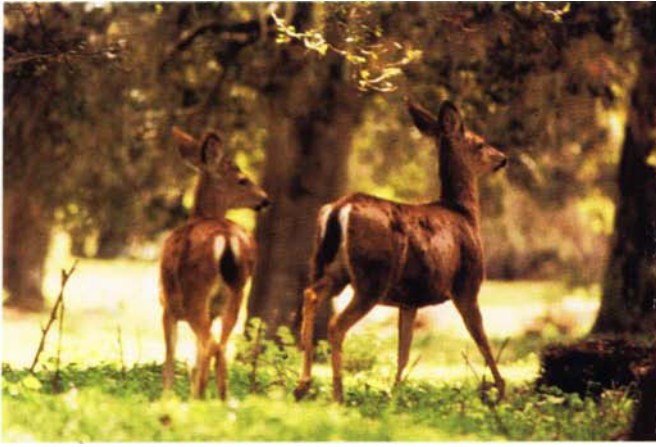
Scientists at HREC have undertaken important investigations of the relationships among wildlife, parasites and human disease. Columbian black-tailed deer, left , host at least 86 species of parasitic helminths, flies, ticks, mites and fleas,