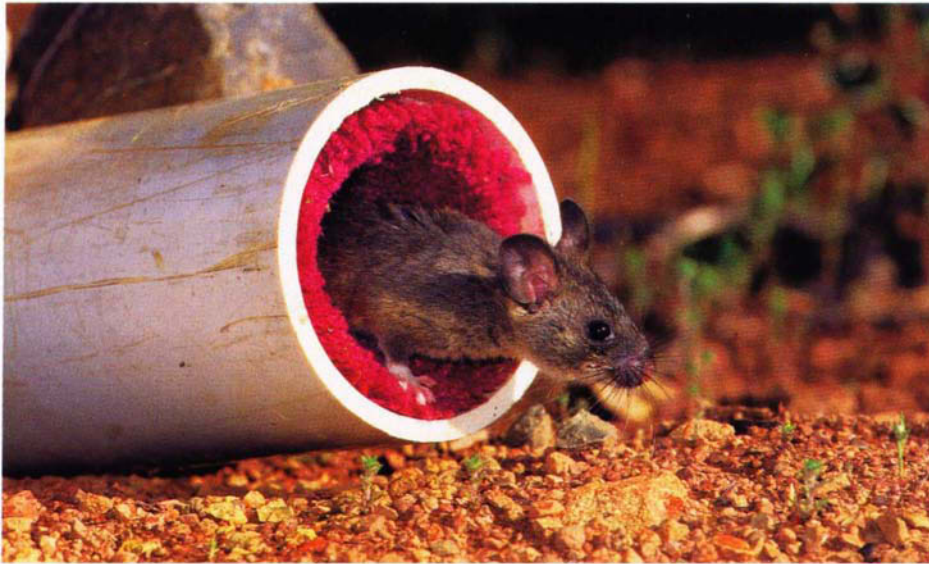
When wood rats travel through a permethrin-treated bait tube, their flea and tick populations are significantly reduced. Modifications of this treatment could help to reduce tick vectors of human pathogens on other types of wildlife.

emerging diseases: the Lyme disease spirochete ( B. burgdorferi ), the most significant emerging arthropod-borne disease in the Northern Hemisphere; the closely related and recently described spirochete B. bissettii , which has been incriminated as causing a Lyme disease-like illness in humans in Slovenia (Strle et al. 1997; Postic et al. 1998); and a little-known but significantly different variant of Colorado tick fever virus that occasionally may infect people in western California (Lane et al. 1982).