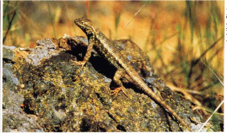
some of which carry infectious disease agents. When infected nymphs of the western black-legged tick attach to the western fence lizard, right , they imbibe proteins with the blood meal that invariably destroys the Lyme disease spirochete.

abundance or spread of infectious disease organisms. In Sweden, the observed expansion in the density and geographic range of the sheep tick ( Ixodes ricinus ) is believed to be due partly to the mild climate of the 1990s (Lindgren et al. 2000). Because the sheep tick is the primary vector of Lyme disease spirochetes and tick-borne encephalitis virus in northern Europe, it is likely that many wildlife populations as well as humans are encountering these pathogens for the first time.