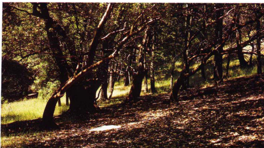
An epidemiological study of a Northern California rural community found that 24% of the population tested positive for Lyme disease. Frequent exposure to leaf-litter areas in hardwood forests may be linked to these high infection rates. The white cloth is dragged over the litter surface with a wooden handle to collect western black-legged tick nymphs; tick larvae and nymphs are found in leaf-litter areas much more frequently than the adults.

mid-1970s, Lyme disease has become a well-publicized and -monitored problem in that region and the upper Midwest. However, in the mid-to-late 1980s, Lyme disease was still thought to be a rare disease in the far-western United States that occurred episodically among hikers and other outdoor enthusiasts. In fact, some California physicians considered it a medical curiosity or even denied its existence. The low infection prevalence detected consistently in adult ticks during the initial tick/spirochete surveys in Northern California and southern Oregon reinforced this misconception (Burgdorfer et al. 1985; Bissett and Hill 1987).