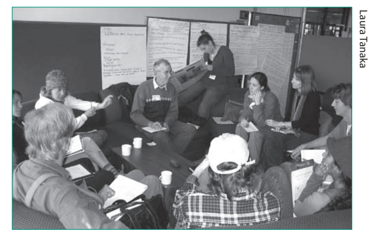
Community members in Santa Cruz, California meet to discuss ways of improving the region's food system.

For a question to be addressed it must come from a group that can demonstrate it lacks the resources to conduct the research, and that it will make good use of the results. While early research was conducted primarily by faculty members, much of the work is now conducted by students who receive academic credit for their efforts. Because academic requirements typically require research and writing papers