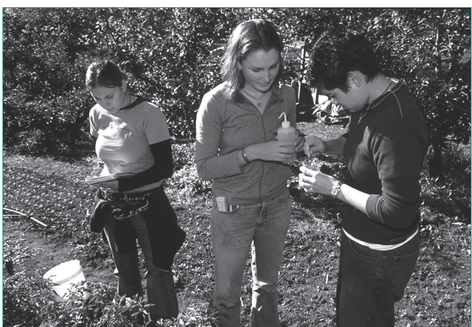
Topics to be addressed at the conference in January include the use of campus farms, such as the UCSC Farm, in sustainable agriculture education programs.

For more information on the conference, contact Albie Miles at afmiles@ucsc.edu, 831.459-4661, or Mark Van Horn at mxvanhorn@ucdavis.edu, 530.752-7645. Additional details about the needs assessment, conference program, and registration information are posted on the Center's web site (www.ucsc.edu/casfs).