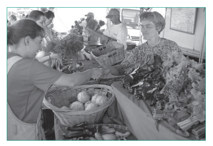
Social issues research at the Center includes studies of the ways that consumers perceive of social issues in the food system, including such issues as workers' rights and salaries, and the value of small-scale agriculture.