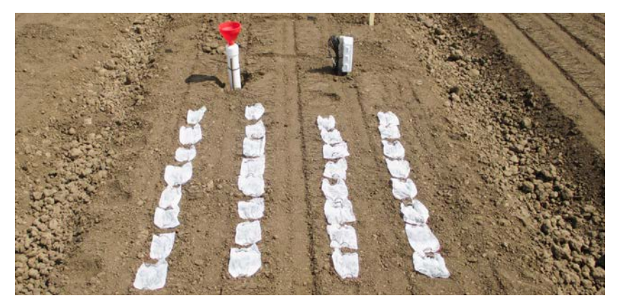
Polypropylene mesh bags containing organic fertilizer were placed on the soil surface to simulate a topdressed application.