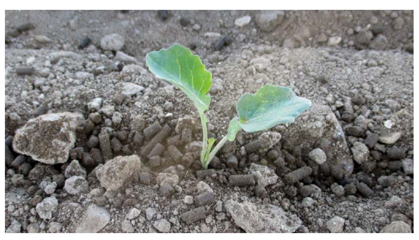
Pelleted organic fertilizer in a broccoli field.