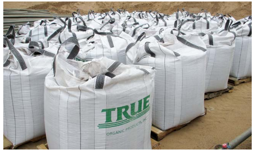
Bulk delivery of organic fertilizers.

application rates are often at or above these N uptake values. However, as will be discussed below, the net amount of N released from organic fertilizers during the crop cycle is less than the total N content of the crop. Over all sites, the amount of N released from applied fertilizer was less than crop uptake: average crop uptake was 97 lb N/ac and the average net release of N from applied fertilizer was 83 lb N/ac (table 1). It appears that the other sources of N, such as residual mineral N, mineralization of N from soil organic matter, and nitrate-N in irrigation water, while modest, were sufficient to supplement fertilizer N to achieve economically viable yields.