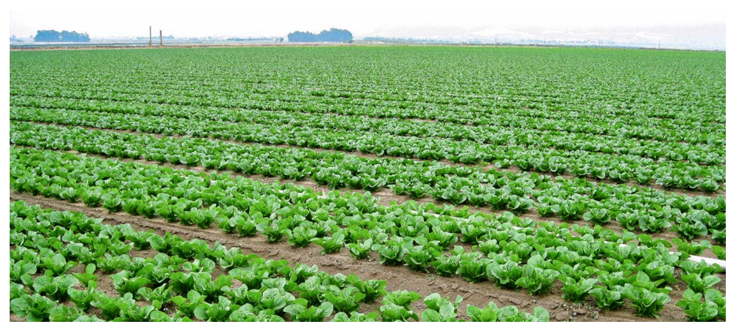
Lettuce mid growth cycle.