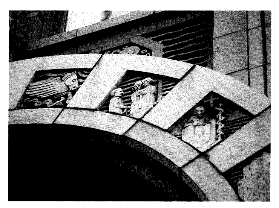
Detail of entrance arch.