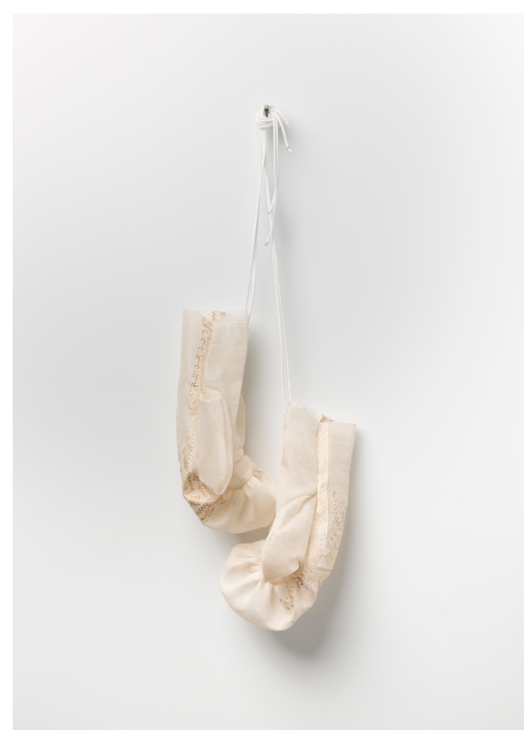
GLOVES, 2017-19, Pre-embroidered piña jusi fabric, silk thread, nylon rope, & nail, 11 x 32 x 6 inches. Collection of the Fine Arts Museums of San Francisco.