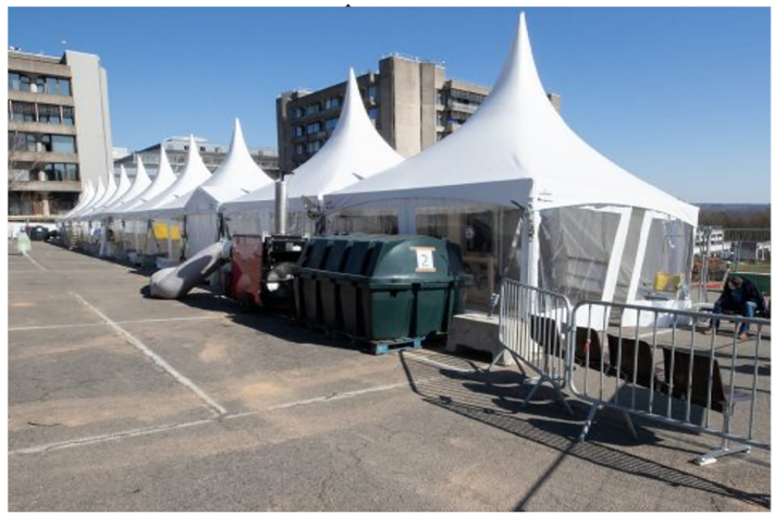
Figure 1. COVID triage centre, University Hospital, Liège (Belgium).

Patient screening and triage is a key opportunity for educating COVID-19 patients to prevent them from transmitting the disease. Effective triage should include patient education at discharge. Despite the constraints (unpredictable workload, in particular), triage and testing settings should be viewed as a good place to improve future patient adherence