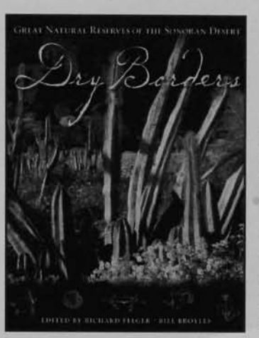
321 halftones, 27 illustrations, 80 color photographs, 5 maps Cloth $80.00 Paper $45.00

Part natural history, part call to conservation, and part love song, Dry Borders speaks to the part of our souls that longs to delve beneath surface appearances to find the true, beautiful heart of the place.