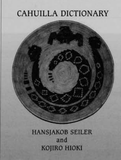
Coming March 2006!

Wholesale orders can be faxed to 951-849-3549 or emailed to malkipress@aol.com