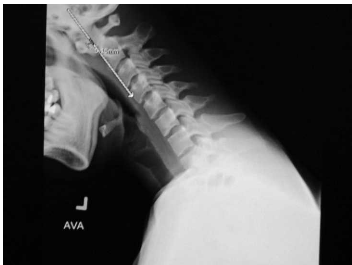
Figure 3. Flexion view of plain cervical spine. This image shows abnormal translation of the articulation between C1 and the C2 os odontoideum in relation to the remainder of the C2 vertebral body.

magnum. 2 The incidence of os odontoideum is unknown because the lesion is usually asymptomatic. 2