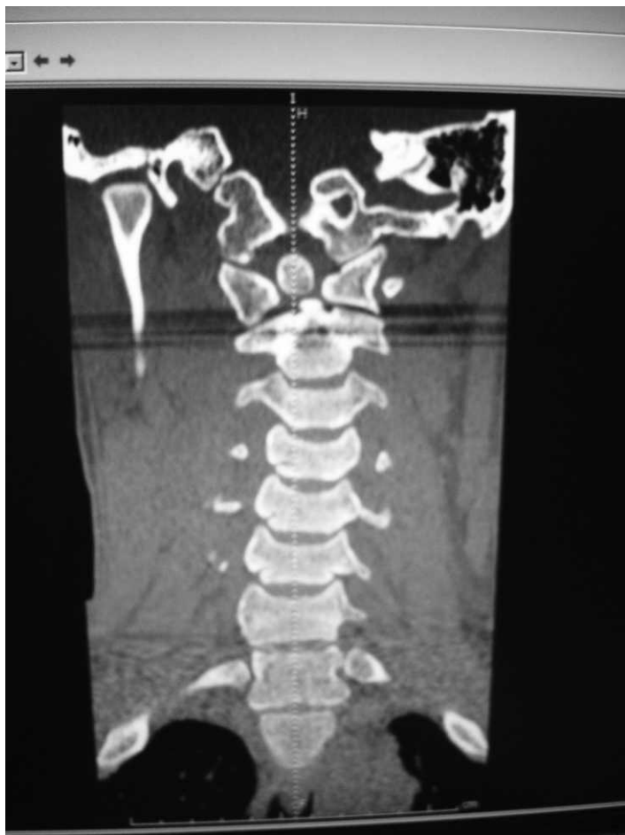
Figure 1. Noncontrast computed tomography of cervical spine. This shows an unfused dens (os odontoideum).