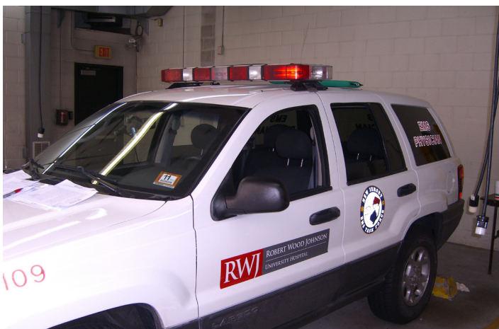
Figure 2. Vehicle used for study.