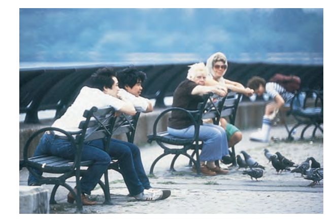
Watch what people do, as well as what they say, when evaluating a public space.

As a result, many cherished public spaces have been destroyed while opportunities to create new ones have been fumbled. We must do a better job of learning from these mistakes, and work harder to create new spaces in the context of the dramatic changes now taking place in American cities.