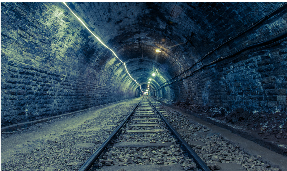
Figure 1: The Khewra Salt Mine, a major producer of rock salt and brine, is a popular tourist destination and the second largest salt mine worldwide.

The IGN has frequently partnered with organizations such as the WHO and UNICEF to act as a bridge between scientific research on IDD and the implementation of global solutions like iodized salt. 9 In China, salt iodization programs have also shown positive results. 8 China's health of-