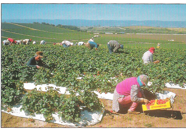
Jobs in agriculture attract Mexican workers to California, but usually offer povertylevel wages.

Simultaneous-equation regression analysis is widely used to estimate economic relationships involving more than two dependent variables (we attempt to explain the behavior of dependent variables with the model). In these cases, a regression equation is specified for each of the dependent variables. Our model has five dependent variables: immigration (the change in a community's foreign-born population between 1980 and 1990); the number of people living in impoverished households; the number of people in households with welfare income; the number employed in farm jobs; and the number in nonfarm jobs. These dependent variables are functions of independent variables (community population, foreign-born population, farm and nonfarm employment, and poverty at the start of the 1980 to 1990 period, etc.) as well as of each other (e.g., welfare use is a function of poverty; immigration is a function of farm employment and farm employment is a function of immigration; poverty is a function of immigration and of both farm and nonfarm employment). Because the dependent variables are all potentially interrelated, the five equations are not estimated independently, but rather as a system, using the three-stage, leastsquares method. - J.E.T.