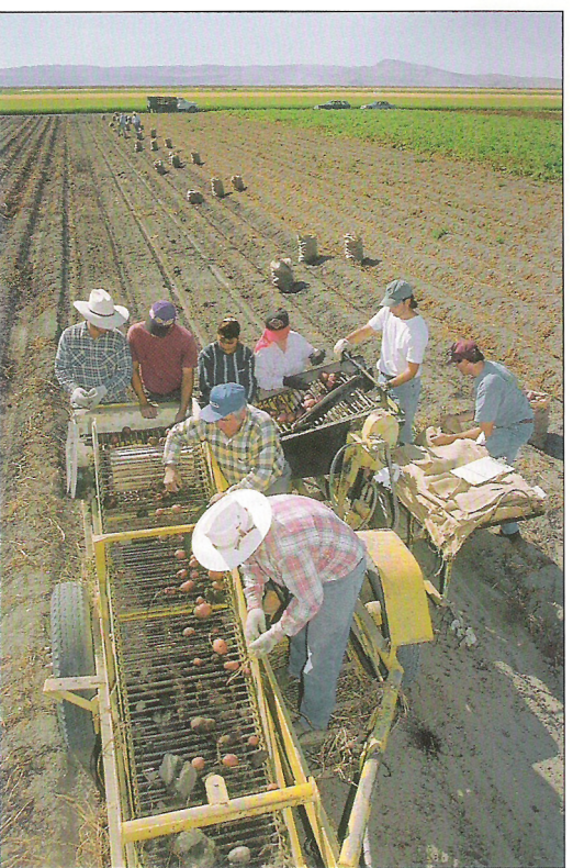
Technology has tended to focus on increasing the productivity of land, not workers.

you implement welfare reform in a place with no jobs" (Arax 1997).