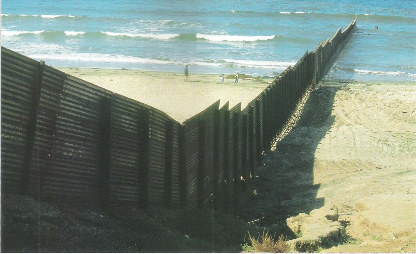
A USDA survey found that more than half of California's farm laborers during 1998 were unauthorized, despite fences along the U.S./Mexico border south of San Diego.

der encourages once-seasonal migrants to remain in the United States throughout the year and raise their families here, creating new publicservice demands in California's rural communities (see p. 11).