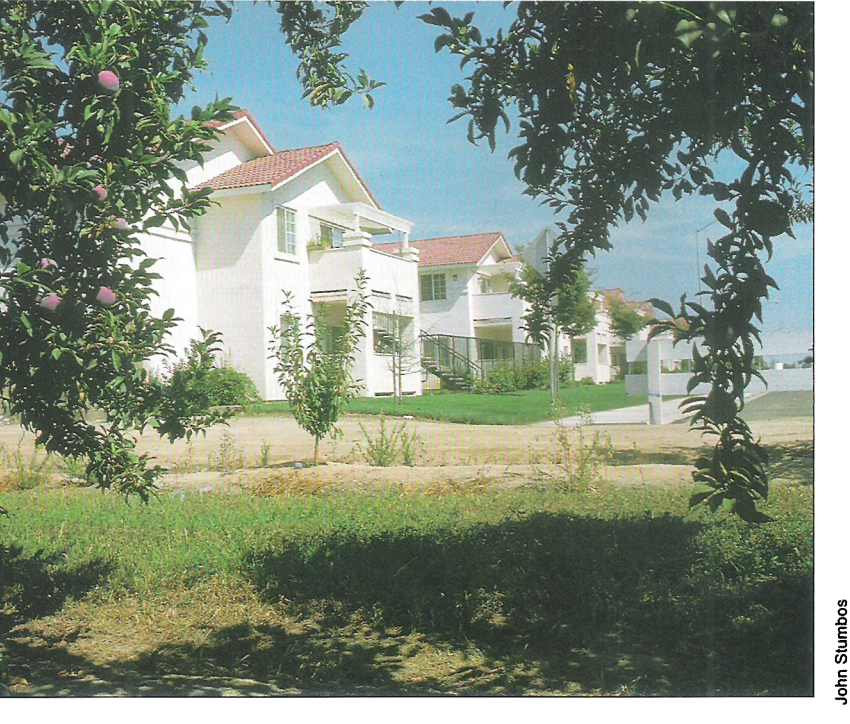
New subdivisions are springing up in and around Parlier, a small city about 20 miles from Fresno.

tween farm employment and both immigration and poverty. Other things being the same, a 100-person increase in farm employment was associated with 139 more people living in poverty during the 1980s. That is, the poverty multiplier of an additional farm job was 1.39. Farm employment increased poverty both directly, by offering farmworkers below-poverty earnings, and indirectly, by stimulating immigration of people with few skills.