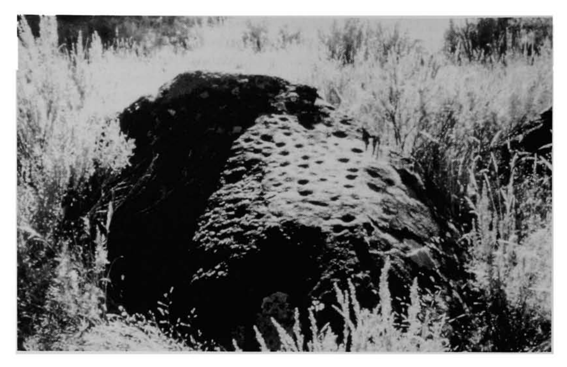
Fig. 1. Pitted boulder, Modoc County, California. Photograph by Arlene Benson, c. 1987.