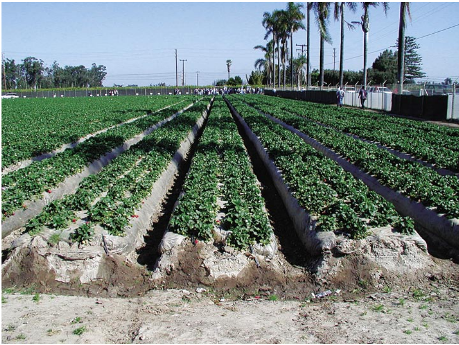
After the methyl bromide rules were implemented, growers reported increased costs and lost income due to lower yields on untreated acreage, reduced sales to the freezer market, and additional labor, equipment and notification costs.

prior to bed construction. The scientific studies consulted by the DPR indicated that bed fumigation had a much larger emissions ratio than flat fumigation, so that human exposure to methyl bromide was much greater given the amount of methyl bromide applied. In order to provide the same protection for human health, larger buffer zones were required for bed fumigation. Due to the larger buffer zones and the associated loss of fumigated acreage, some growers found it preferable to switch to flat fumigation. Flat fumigation is much more expensive, however, at least an estimated $1,000 per acre more than bed fumigation. This regulation benefited pesticide applicators, because most growers did not have the equipment necessary for flat fumigation and had to hire custom applicators.