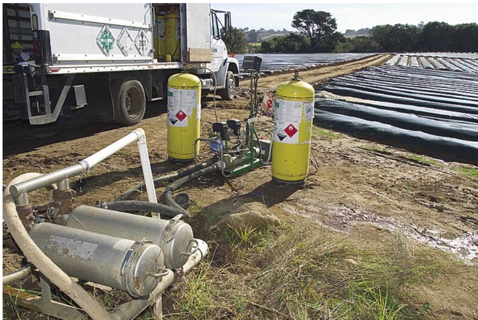
Jack Kelly Clark

The DPR methyl bromide use restrictions imposed in 2001 were complex. Two types of buffer zones were specified: an inner buffer zone and an outer buffer zone. The size of each buffer zone depended on such factors as the size of the application block (acreage fumigated in a 24-hour period), the application rate, the method of application, the proximity of the field to houses or other occupied buildings, and the willingness of neighbors to allow the fumigation to proceed. For both types of buffer zones, the operator had to obtain permission from the neighboring landowner to extend the buffer zone onto the adjacent property.