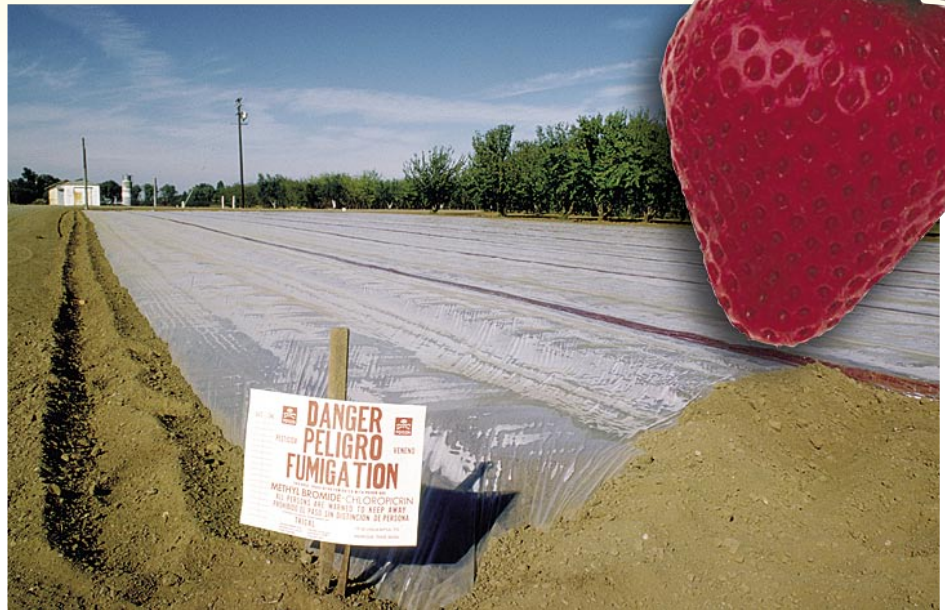
Jack Kelly Clark

The DPR's use regulations are administered through a permit process. In order to apply a restricted-use pesticide,