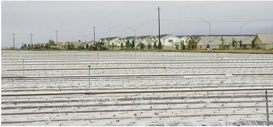
Near Salinas, strawberry fields are directly adjacent to residential areas. If growers choose not to farm at the rural-urban interface due to regulatory concerns, such agricultural lands could be at greater risk of conversion to residential or commercial uses.

was reduced from 50 to 30 feet for very low emissions per acre and relatively small application blocks.