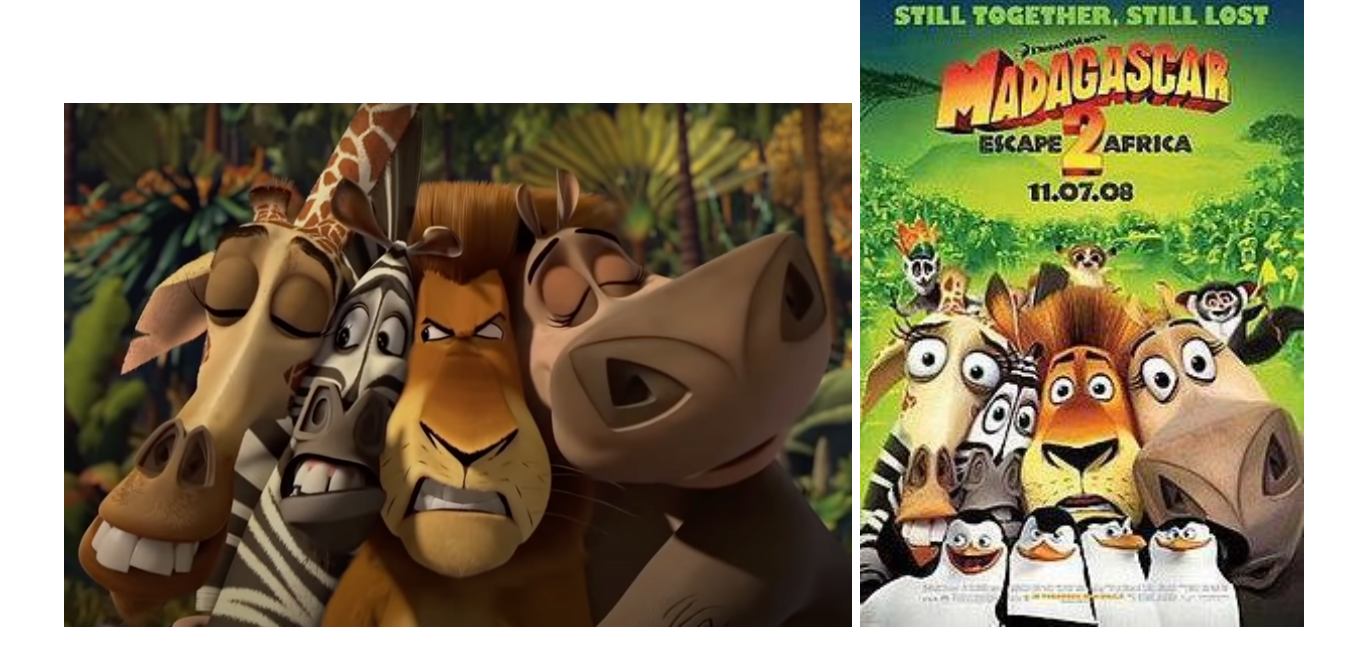
Fig. 1. Zoo Animals arriving on the Island from Eric Darnell et al.; "Madagascar"; YouTube , YouTube, 17 Oct. 2021, www.youtube.com/watch?v=5bbcWPTq0mE&t=187s.