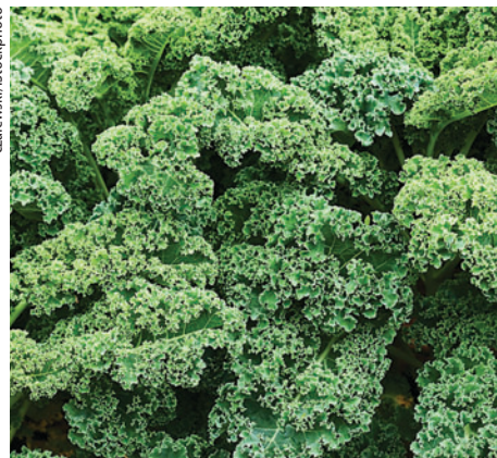
Antioxidants, found in vegetables such as kale, protect against oxidative cell damage and are important for high-intensity aerobic athletes.

Fat. Besides yielding a substantial amount of energy, dietary fat provides important fat-soluble vitamins (A, D, E and K) and essential fatty acids. Dietary fat