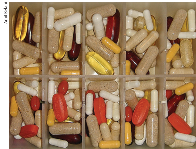
Critical vitamins can be obtained in a variety of foods, or, if necessary, dietary supplements.

Carbohydrates. Carbohydrates are important components of an athlete's diet, particularly an endurance athlete's. Besides being a primary macronutrient for energy metabolism, carbohydrates are needed to efficiently maintain the muscle glycogen that athletes use as fuel for vigorous exercise. It is recommended that athletes consume a high-carbohydrate