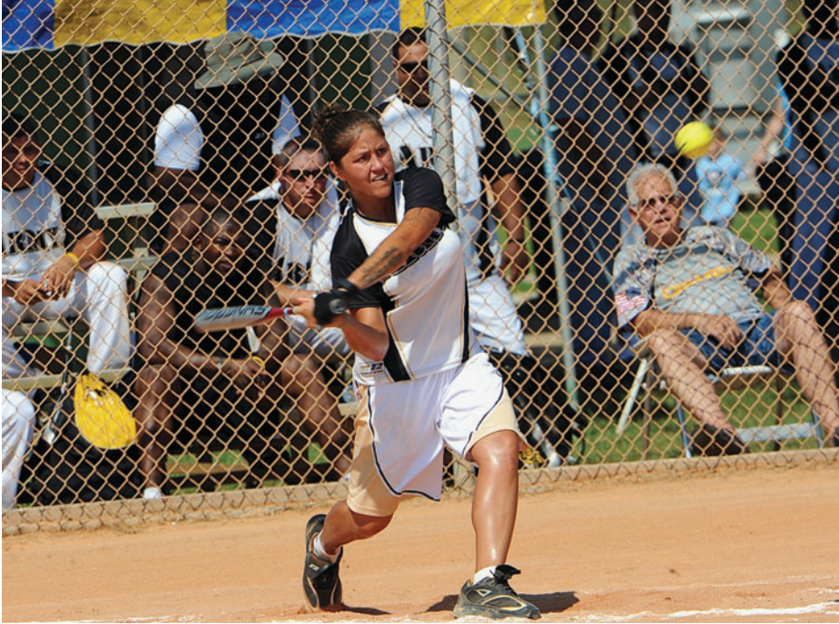
Dietary restraint, such as skipping meals or avoiding “fattening” foods to control the shape or weight of one’s body, can be associated with failure to ovulate and low bone mass. Female athletes in lower-intensity sports such as baseball are less prone to these problems.

they were divided into three regimens where they continued to exercise at the same level but consumed a diet that was (1) adequate (met needs), (2) insufficient (met about 75% of needs) or (3) deficient (met about 55% of needs).