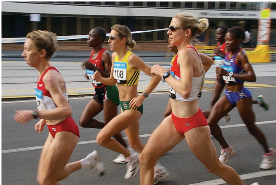
Girls and young women who participate in endurance sports such as long-distance running may suffer negative health outcomes as well as positive ones. They may have a higher risk of low bone mass, menstrual disturbances and disordered eating.

In 1971, male competitors outnumbered females by more than five-to-one in college sports and more than twelve-to-one in high school sports (NCWGE 2008). Due to regulations set forth by Title IX, the number of female competitors in the