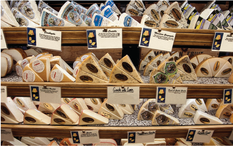
Endurance and power athletes may need twice as much protein as sedentary individuals. After exercise, high-quality proteins, such as those found in dairy products, are critical to muscle repair.

should make up 20% to 35% of the total diet and should provide no less than 20% of total energy needs to benefit athletic performance (Rodriguez et al. 2009).