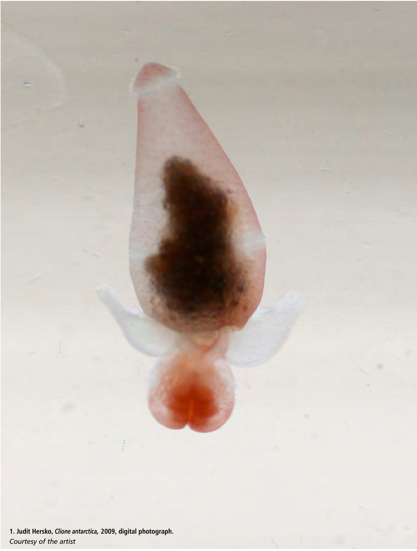
1. Judit Hersko, Clione antarctica , 2009, digital photograph.