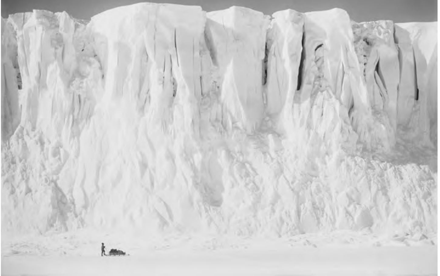
2. Herbert C. Ponting, Barne Glacier , December 2, 1911, photograph.

the Book of the Unknown Explorer ” (2008-2012) are taken from my book project, tentatively titled “Contemporary Art and Climate Change of the Polar Regions: Gender After Ice.” The artworks discussed here and in my book project suggest how visions of the polar regions and elsewhere present us with new understandings of a world now under threat from climate change. These show not just variables related to the weather but also basic transformations of culture and the sense of loss and uncertainty that is connected with that.