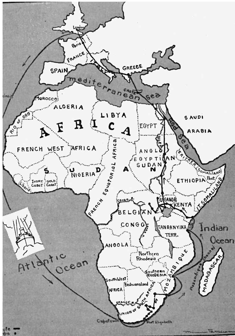
7.1. Map depicting route of entire trip, from Eslanda Robeson, African Journey (New York: John Day, 1945).

hear them talk, and see what I saw." 8 Essie did not want to shy away from what she saw. Nor did she want to embellish suffering. Rather, she chose to look and write with political commitment and human solidarity, always aware of her unique and privileged position.