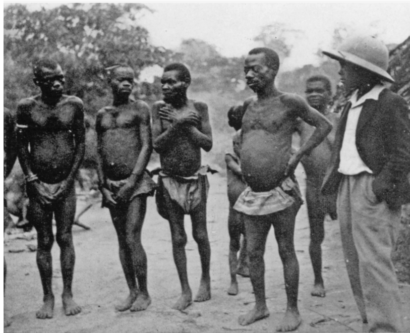
7.5. "Pauli with the Elders of Ngite,", from African Journey.

not uncomplicated or without challenge. For example, throughout African Journey Robeson identifies her kinship and connection to the people she encounters and articulates a privileged access to the hidden transcripts of African colonial subjects. What aided her in gaining this access: her blackness? That she traveled alone with a child? That she was wife to the famous Paul Robeson? Indeed, was Essie flattering herself by imagining a belonging that she didn't actually possess, a brutal revelation that Saidiya Hartman discovered she must make peace with when she was hailed as "obruni" or foreigner by Ghanaians in her own African journey, as she described in Lose Your Mother a half century later? In terms of Essie's camera work, did her fierce desire to counter Hollywood and other dominant misrepresentations of Africans lead her to own misrecognitions?