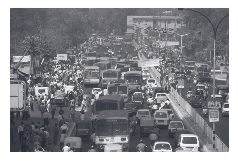
Figure 1 Traffic in Delhi

The Delhi road system was not designed and is not managed with this disparate vehicle mix in mind. The diverse traffic characteristics, modal mix, and land use patterns have overwhelmed the capabilities of the authorities. It is widely believed among local transportation professionals that modest efforts at managing traffic flows and separating motorized and non-motorized vehicles would greatly reduce congestion. None, however, could cite successful local examples during interviews.