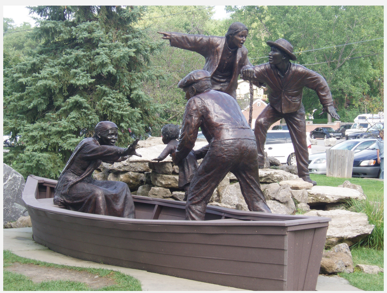
Freedom Crossing Monument, Lewiston, New York.

it. The customer is not a statistic—[they are] a flesh-and-blood human being completely equipped with biases, prejudices, emotions, pulse, blood chemistry and possibly a deficiency of certain vitamins.1