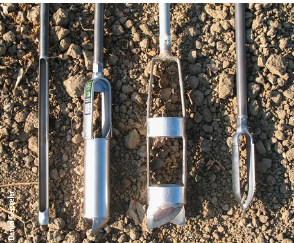
Different tools are available for soil sampling, including (left to right) soil probe, closed bucket auger, open bucket auger and Dutch auger. Under most conditions, the standard soil probe is the best option for most alluvial cultivated soils. Bucket augers work well in stony soils. Open bucket augers are useful in wet clay rich soils. Dutch and Edelman augers may be a better choice than soil probes in stony soils and soils where woody roots are present.

Plant tissue tests do not detect excess soil P supplies (Mallarino 1995; Mallarino