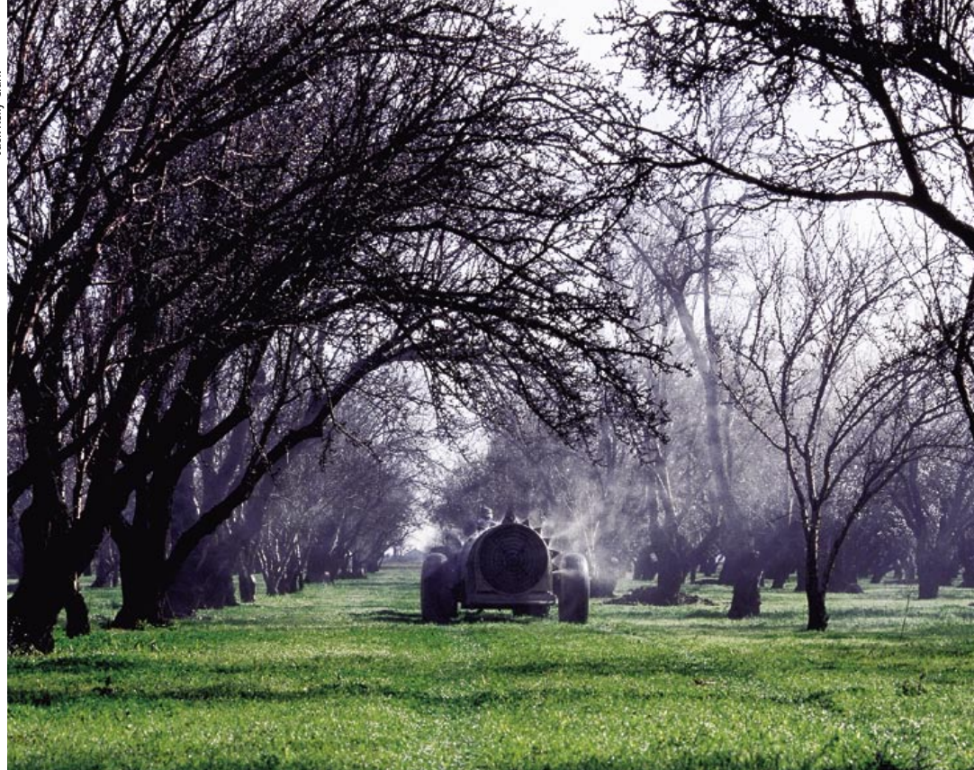
Air blast sprayers are used for ground applications of pesticides in orchards. Almond growers reported applying dormant season, May and hullsplit insecticide sprays less frequently in the current survey than in a 1985 study.

A completion rate of 39% resulted in a final response set of 453 growers (table 1). Three hundred and twenty-