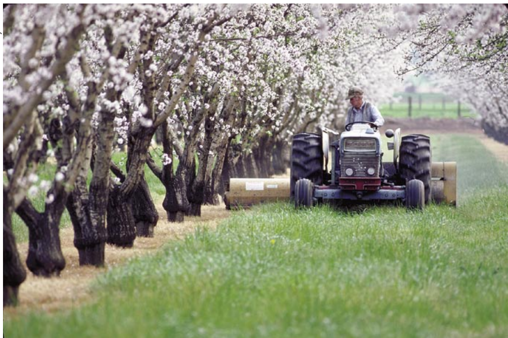
Strip weed control is used by many almond growers to manage orchard floors. Among the benefits of this approach is reduced pesticide runoff.