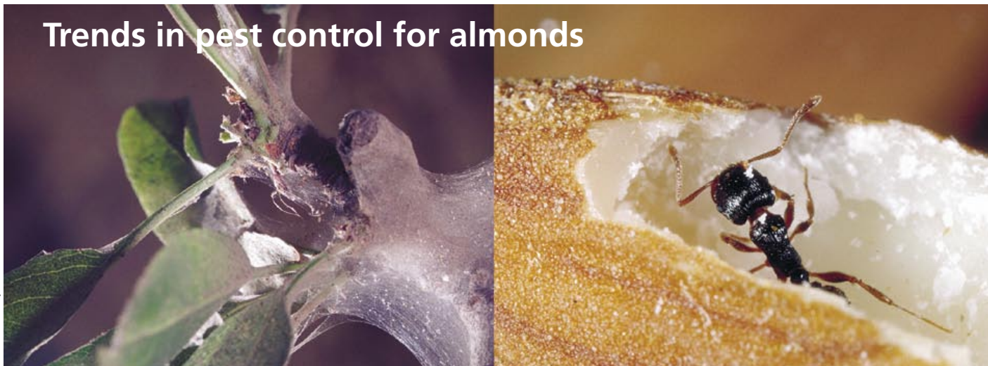
Between 1985 and 1999, there was a large increase in survey respondents who perceived mites and ants as control problems in almond orchards. Left, Tetranychus spider mites produce webs; right, the southern fire ant feeds on almond nut meats.