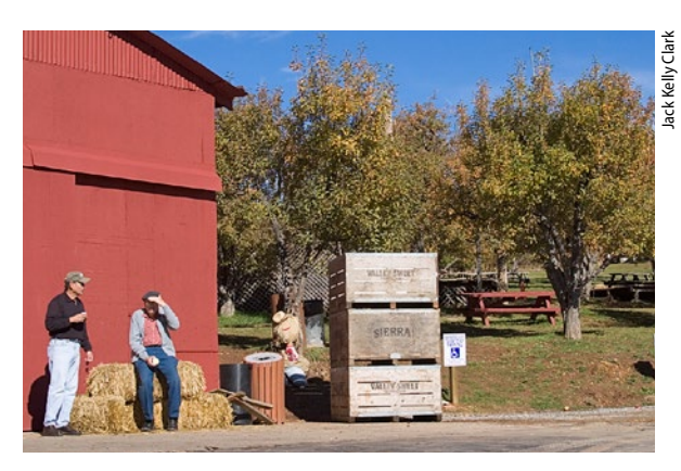
More than 750,000 visitors tour the Apple Hill area each year to buy fresh apples and apple products.

Today, the Apple Hill Growers Association has grown from 16 farmer members to over 55, and Apple Hill has the largest concentration of apple growers in all of California. Their efforts have paid off: Apple Hill has become a very popular tourist destination in Northern California. More than 750,000 visitors tour the area each year to visit you-pick farms; buy fresh apples and apple products; chop Christmas trees; eat lunch; and stop at a local brewery, spa and wineries.