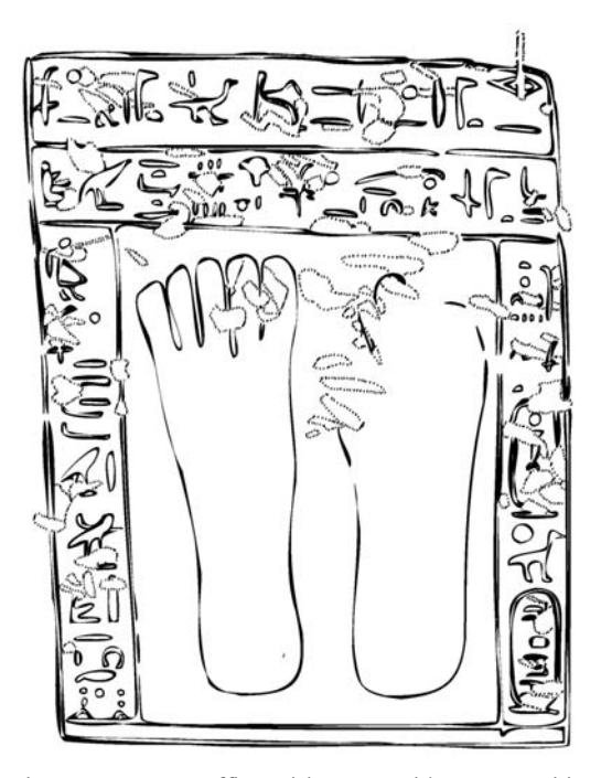
Figure 2. Foot graffito with text and box around it.

The range of figures bearing figural graffiti immense and often exhibits some connection to the location in which the figures were found. Thus sites that had religious significance, such as temples and shrines, may feature a large number of representations of deities—either anthropomorphic images or examples of animals sacred to the local deity (rams, vultures, falcons, bulls, and the like are all seen in various contexts). One complicating aspect of the role of figural graffiti in temple areas is the question of whether the exterior walls, where most of these graffiti are found, bore official decoration (scenes and/or hieroglyphic inscriptions), for we find examples where people emulated already existing decorations by replicating, for example—and usually on a smaller scale—a deity (standing or seated on a throne), an offering table, a sacred bark (fig. 3), or a flower bouquet. In many cases the quantity and size of the graffiti were contingent on the amount of relatively flat space available. In quarries and in way-stops on caravan routes, figural graffiti depicting the "composer" are common (fig. 4), as are depictions of desert animals, cattle, donkeys, and camels.