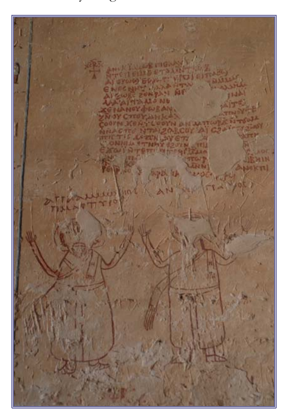
Figure 5. Coptic graffito from KV2 (North wall just inside entrance).

known. One site that may prove instructional with further study is the quarry of Abdel Qurna just north of Asyut on the Nile's east bank (Cruz-Uribe 2004). The site contains a large number of both figural and textual graffiti. On the face of the cliff is a "wall" of boat graffiti, where over the centuries visitors continually expanded the number of examples of boats portrayed. Preliminary dating suggests that the boat graffiti include a range of examples dating from late Predynastic times through the Late Period. It is possible that later visitors to the site found the earlier boat graffiti and emulated them with contemporary examples. We do not yet know why boat graffiti are displayed at this particular site. What we can say is that in the New Kingdom and Late Period the site was principally a limestone quarry, similar to a number of adjacent sites. Over time numerous groups came to quarry stone for official uses and left remains of their visits, as evidenced by the graffiti.