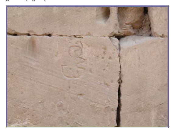
Figure 3. "Emulation" of Khonsu bark figure. West exterior wall of Khonsu Temple, Karnak.

of such boxes has not been studied in depth, but their presence may prove useful for dating and placement purposes and may also provide a means of connecting textual graffiti with figural forms. We also find numerous signs of religious significance, such as pilgrims' feet in and around pilgrimage destination sites (mainly tombs and temples), and religious images on the exterior walls of temples (such as the Khonsu Temple at Karnak), where the general populace honored the local temple gods (fig. 2).