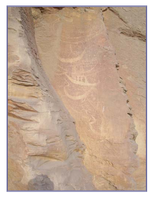
Figure 1. Scene of Abdel Qurna boat graffiti.

of such boxes has not been studied in depth, but their presence may prove useful for dating and placement purposes and may also provide a means of connecting textual graffiti with figural forms. We also find numerous signs of religious significance, such as pilgrims' feet in and around pilgrimage destination sites (mainly tombs and temples), and religious images on the exterior walls of temples (such as the Khonsu Temple at Karnak), where the general populace honored the local temple gods (fig. 2).