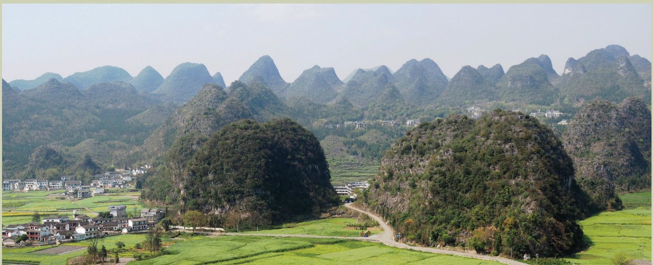
Wan Fenglin in Xingyi Geopark, Guizhou, China: an example of spectacular fenglin-type karst.

The fact that many protected areas, including those recognized by UNESCO, contain carbonate karst should mean that their karst geoheritage is acknowledged and protected. However, within these pro-