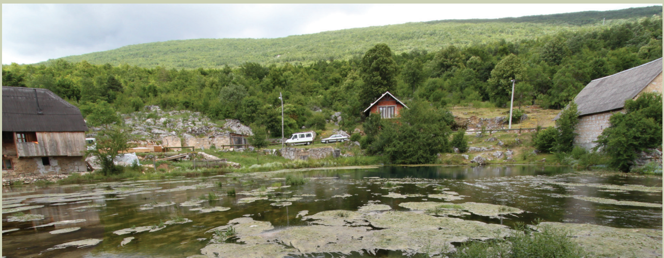
Majerovo Vrilo, Croatia: A large vaclusian spring explored by cave divers to a depth of 92m below the point of emergence.