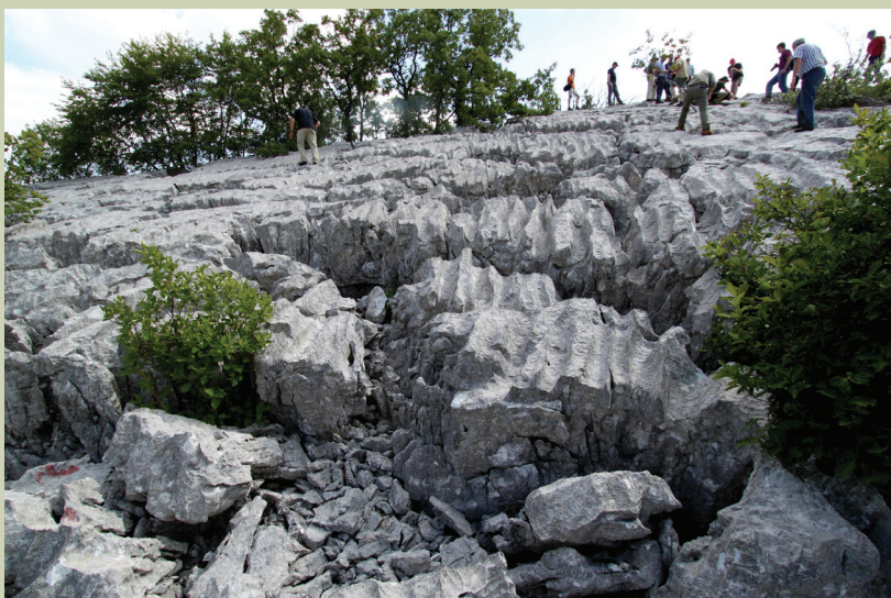
Karren in Montenegro.

In karst areas, streams commonly lose flow, with water sinking into the ground, either gradually over a reach of tens to hundreds of meters or at a single point, and emerging as springs that are sometimes many kilometers from the sink-point. Globally, there are many thousand karst springs, including all of the world's largest springs in terms of average and maximum discharge. The zone between sink and spring may extend beneath non-carbonate rocks that provide no evidence of the karst at depth. Where carbonates crop out, they are commonly devoid of surface drainage and a wide variety of surface landforms may be present depending on climate, lithology, and the presence or absence of superficial deposits. As carbonate rocks are commonly of high purity, the dissolution process yields little material on which soils can form. Consequently, these areas have rocky surfaces on which there are a variety of small solution pits, grooves, and channels, collectively known as karren . Where there is a thicker soil cover, most commonly developed on superficial deposits such as glacial till, loess, or volcanic ash, the surface is typically pitted by closed depressions ( dolines ; also known as sinkholes ) that range in diameter from 2–1000m and in depth from 1–650m. Other typical