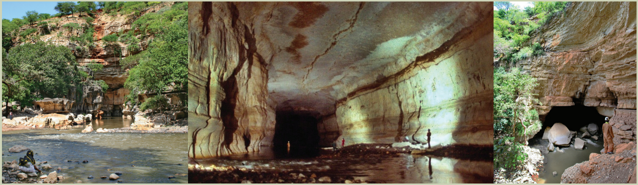
An example of a through cave in Ethiopia. Here, the Weib River sinks at the entrance to Sof Omar Cave (left) and can be followed through large passage (center) to the spring where it emerges (right).

are commonly extracted underground. Surface mines destroy karst landforms, but may also expose features of geoheritage value. Both surface and underground mines commonly intersect cave passages. The resolution calls on IUCN member states to conserve those mining environments that have high natural heritage value (both geological and biological).