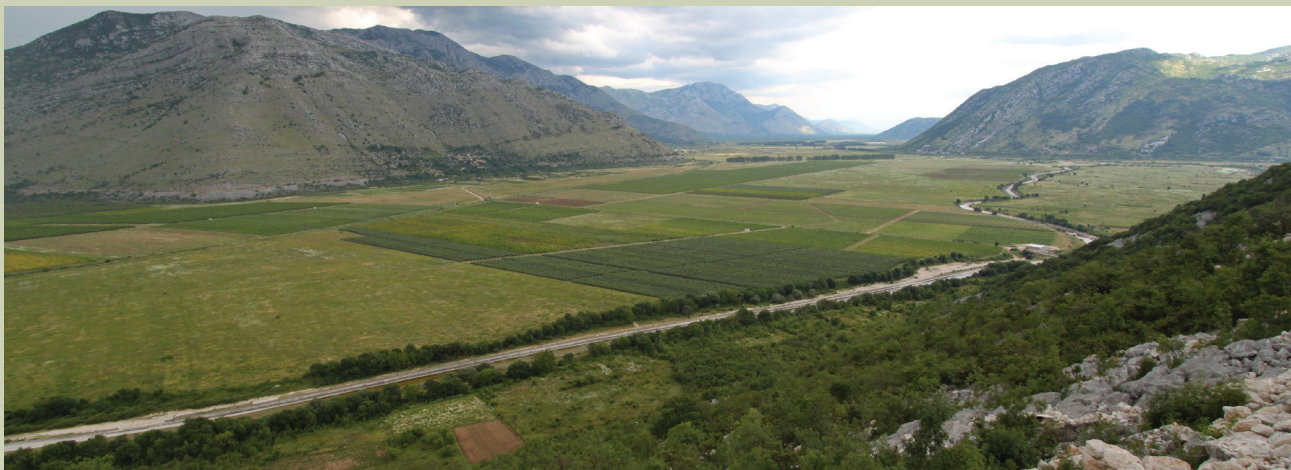
Popovo polje in Bosnia-Herzegovina is around 40km long and up to 5km wide. The Trebinjica River, now canalized, flows along its floor. Under natural conditions there were over 500 sinks ( ponors) and reversing springs ( estavelle).