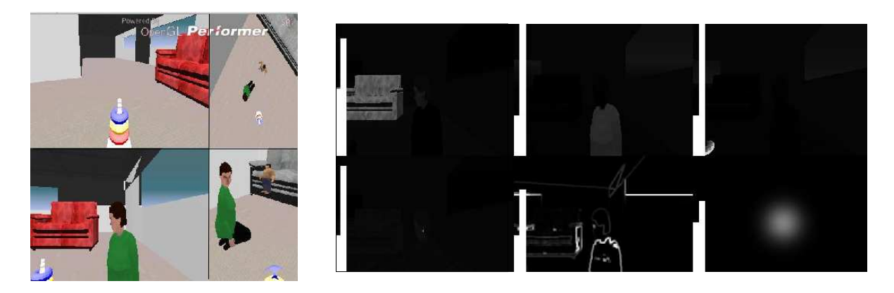
Figure 1. Left: various views of a virtual living room used to model the emergence of gaze following. From top left, clockwise: caregiver's view, birds eye view, lateral view, and infant's view. Right: Saliency maps generated by analyzing the infant's visual input (lower left image in left half of figure). Top row, left to right: red, green, blue. Bottom row, left to right: yellow, contrast, face position. Bars on left of each saliency map indicate the intrinsic reward of this feature and the current habituation level.

robotic modeling approaches in Section 4.